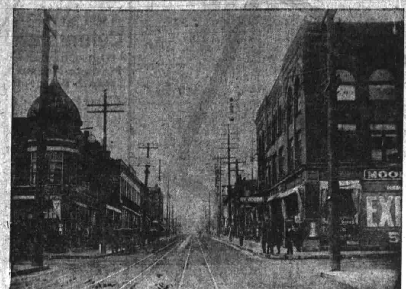
Williams Avenue Looking North From the Intersection at Russell Street.