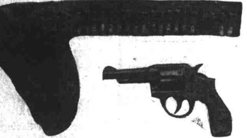
Pistol of Alleged Murderer. Description in Accompanying Article.