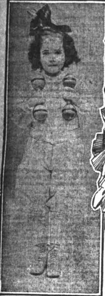
Dumb-bells Are Helpful

T HE natural environment for growing children is, of course, the country. Here they can run and play at will, climbing trees, swimming, rolling on the soft green grass—all exercises that develop every muscle in the young body. The foundation for health in later