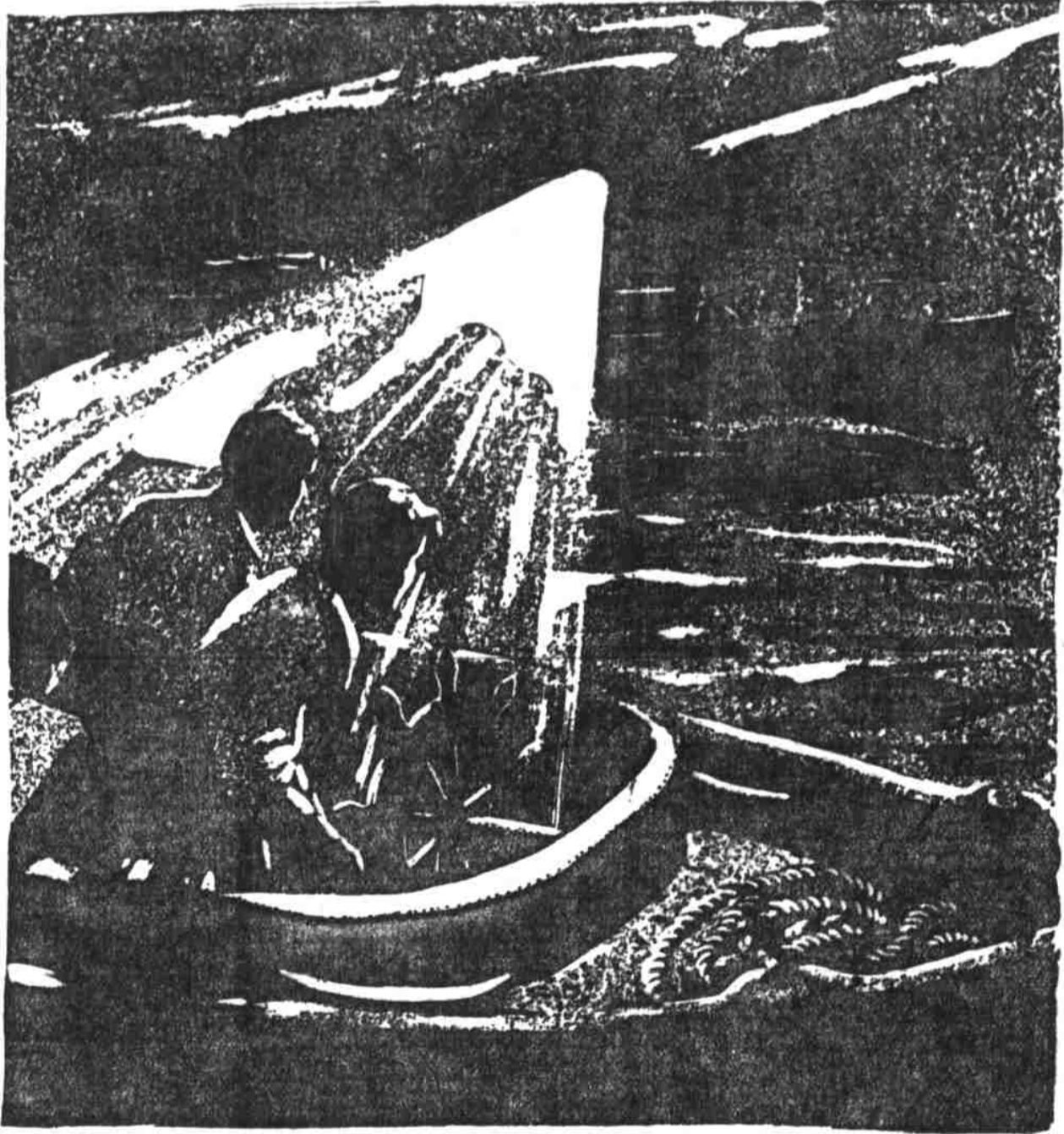
THE SEARCH-LIGHT SUDDENLY SETTLED ON THE LAUNCH.

Suddenly Bob started. "Did you hear that?" he cried. The muffled sound of the explosive pounding of a naphtha-launch came to them over the water.