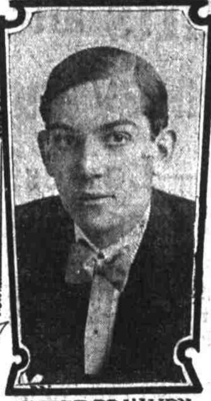
GEORGE M. COHAN'S "GEORGE WASHINGTON JR." AT THE HELLIG. MON. TUES. & WED. NIGHTS FEB. 3, 4, 5. MAT. WED.