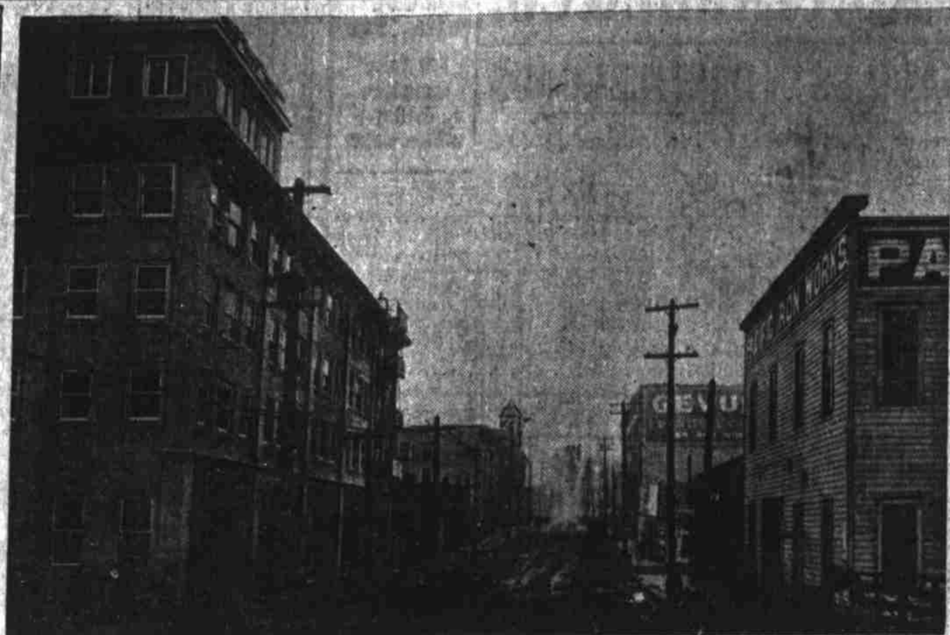
Looking East on Burnside From the Bridge. Planks in Foreground Are Being Used in Repairing the Bridge, Which Has Just Been Given a Thorough Overhauling.

It is thought that the new ordinance to be submitted by a committee from the Federated East Side clubs and the city fathers by Councilman Rushlight will solve many difficulties in the matter of street improvement in Portland, especially as to material, but it is realized that owing to the number and length of streets in this city the problem is an extremely difficult one.