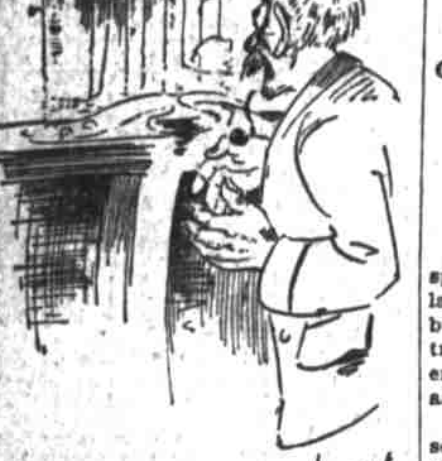
"Bloody Me! If 'Tain't the Cat!"