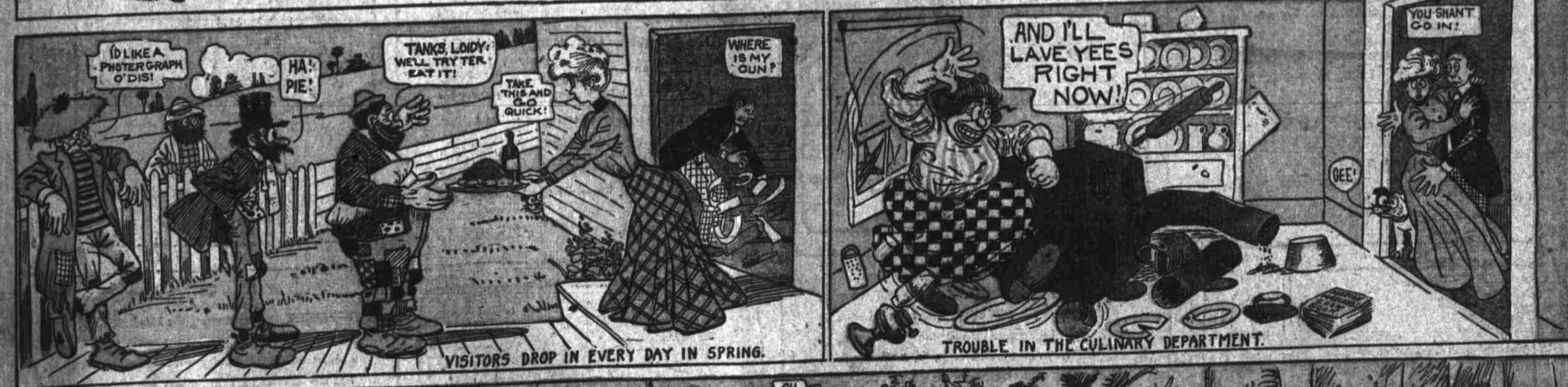
VISITORS DROP IN EVERY DAY IN SPRING.