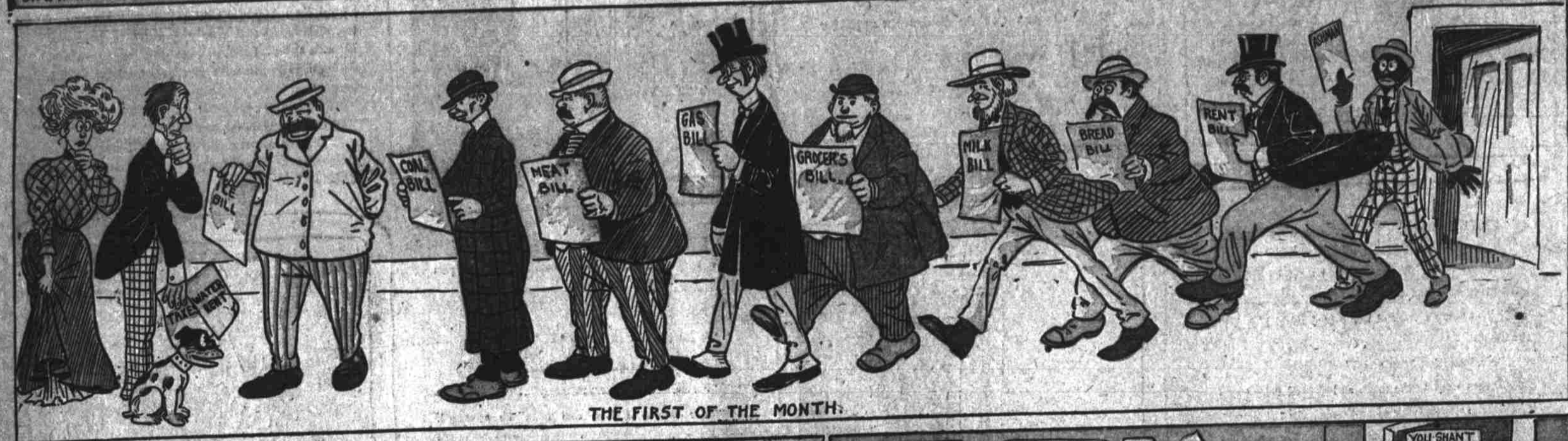
THE FIRST OF THE MONTH.