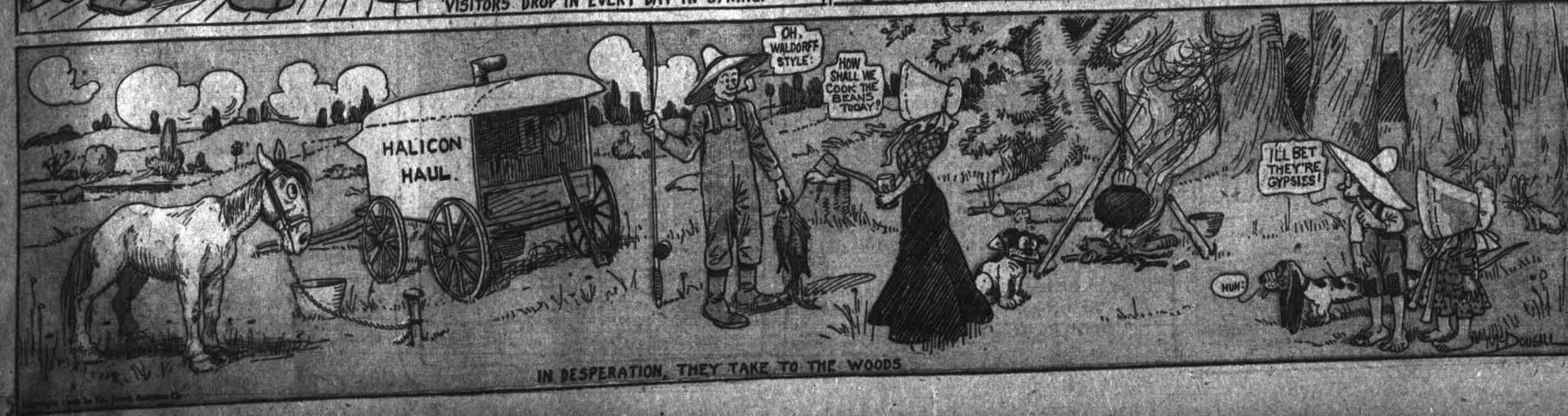
IN DESPERATION, THEY TAKE TO THE WOODS