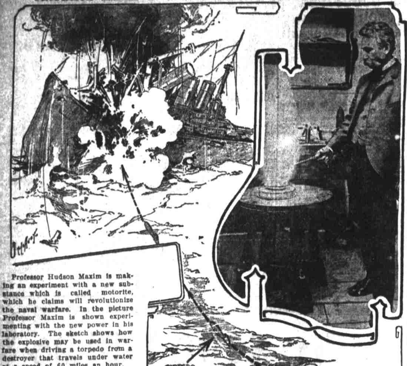
TORPEDO TRAVELING 60 MILES PER HOUR

Professor Hudson Maxim is making an experiment with a new substance which is called motorite, which he claims will revolutionize the naval warfare.