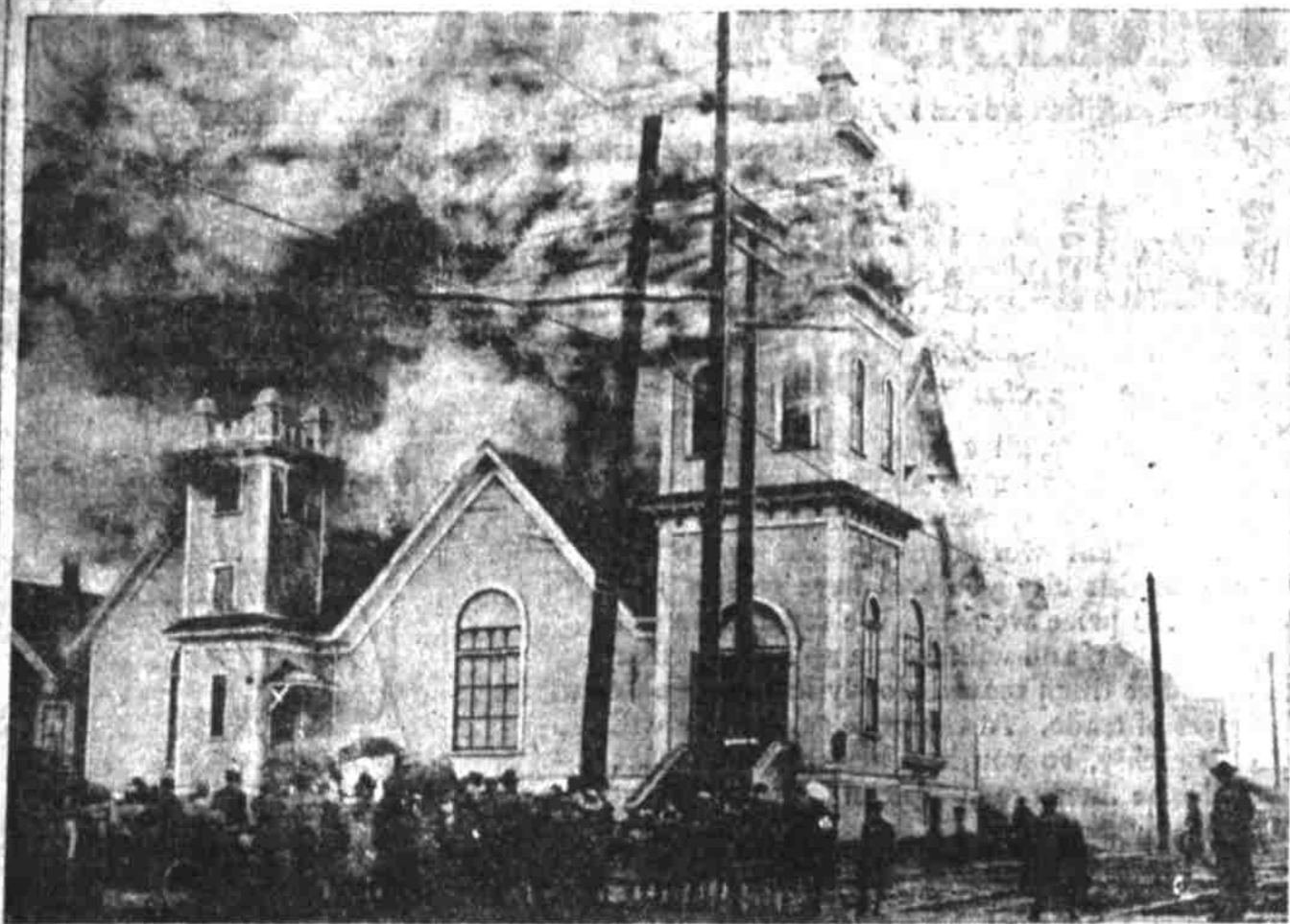
View of Church Taken Just Before Arrival of Department, Showing Origin of Fire Which Destroyed the Structure.

Constructed three years ago at a cost of $10,000, the Forbes Presbyterian church, Gantenbein and Bellwood streets, was burned to the ground yesterday afternoon.