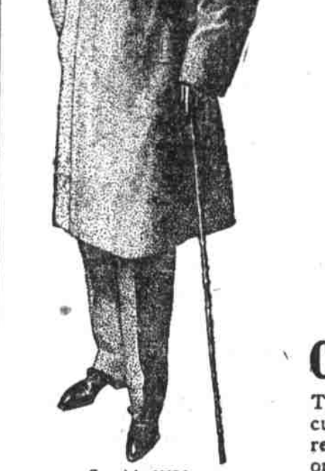
Copyright 1907 by Friend Brothers Clothing Company Milwaukee

Even at the regular prices of $15.00, $16.50 and $18.00, these Suits, Cravenettes and Overcoats are better values than others. But Saturday you buy any of them at $10.00, and pay a little down and $1.00 a week.