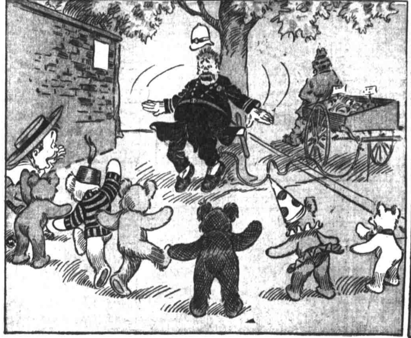
2. Sir Cop awakens with a start. He does not see the "banan" cart, Nor dream of trouble to ensue When the "banan" man wakes up, too.