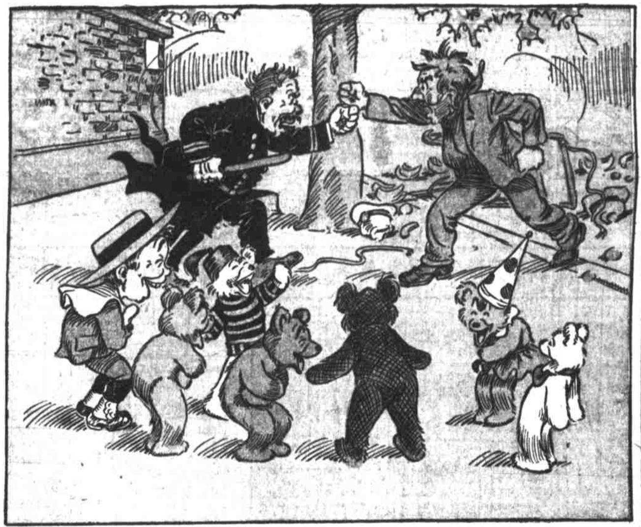
4. The push-cart man is mad, you bet! And blames the cop for the upset. The cop, of course, thinks he knows now Just who's to blame for all the row.