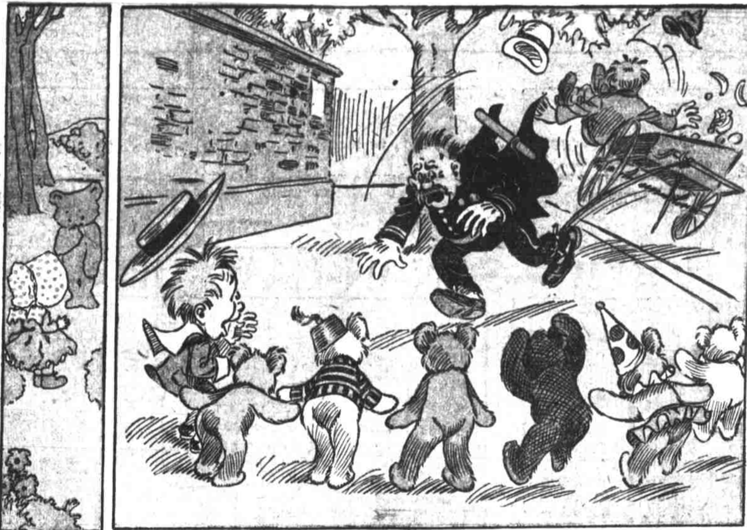
3. Sir Cop first rushes toward the Teds, Intending straight to break their heads. But soon he finds that with his feet He's pulling push-carts through the street.