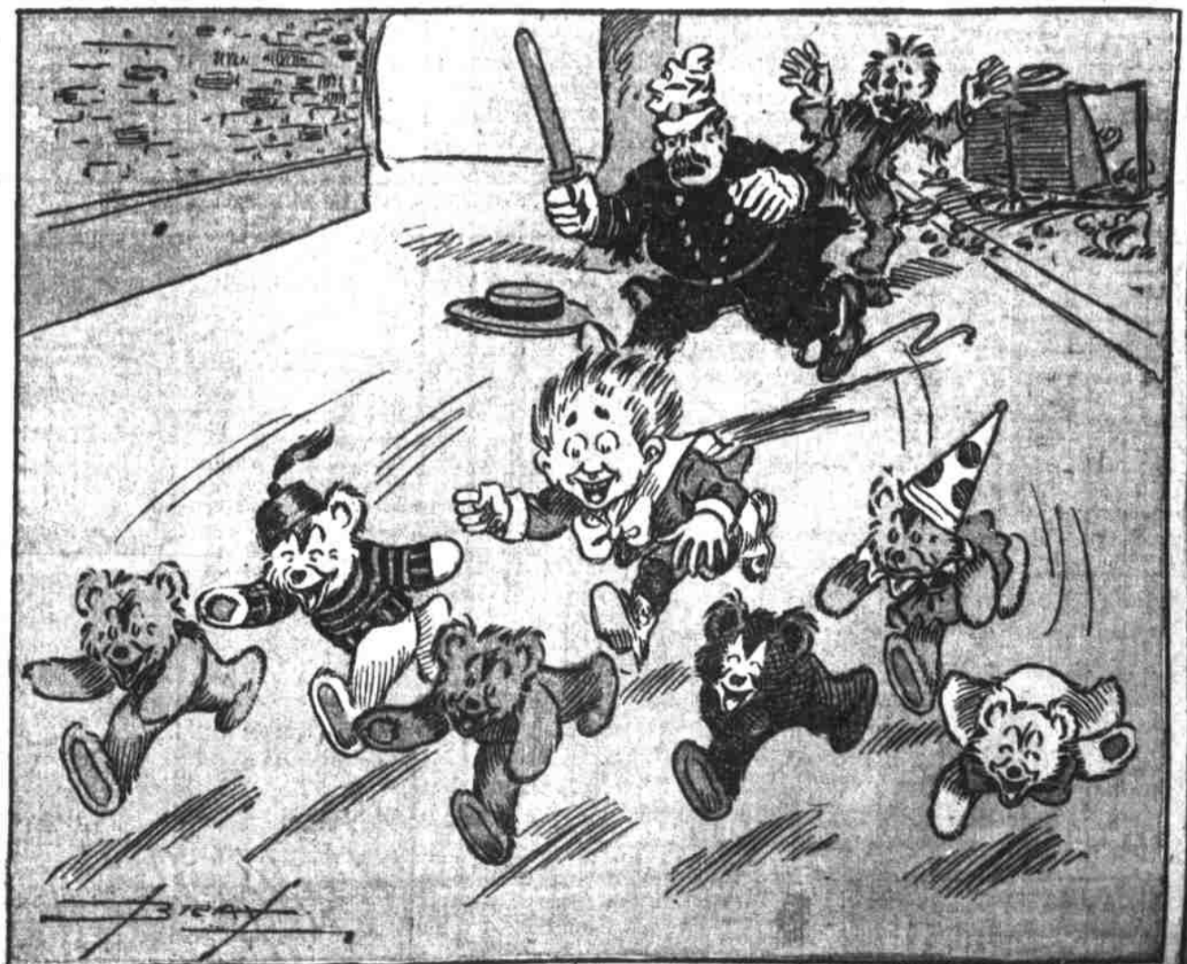
6. And now it dawns on both at once That each has acted like a dunce. Just at this juncture Johnny feels It's time the Teds took to their heels.