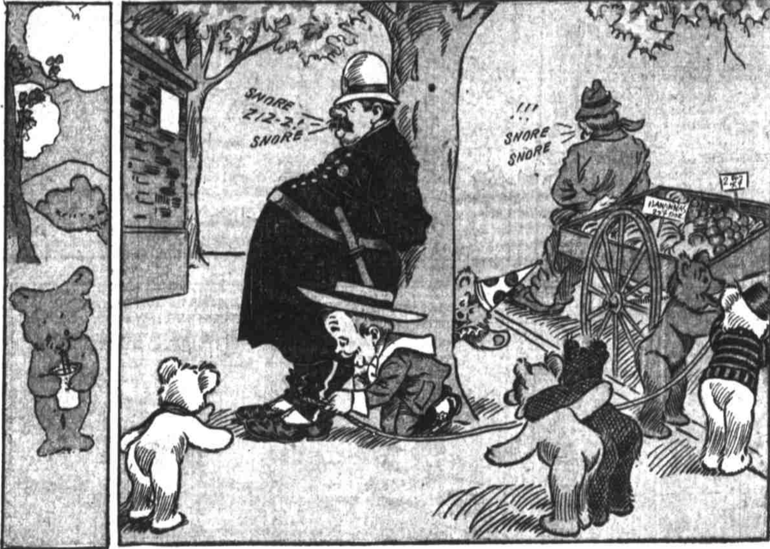
1. A dandy cop against a tree A-snoring is a sight to see. No wonder John and Teds are quick To see a chance to play a trick!

PORTLAND, OREGON, SATURDAY EVENING, NOVEMBER 23, 1907