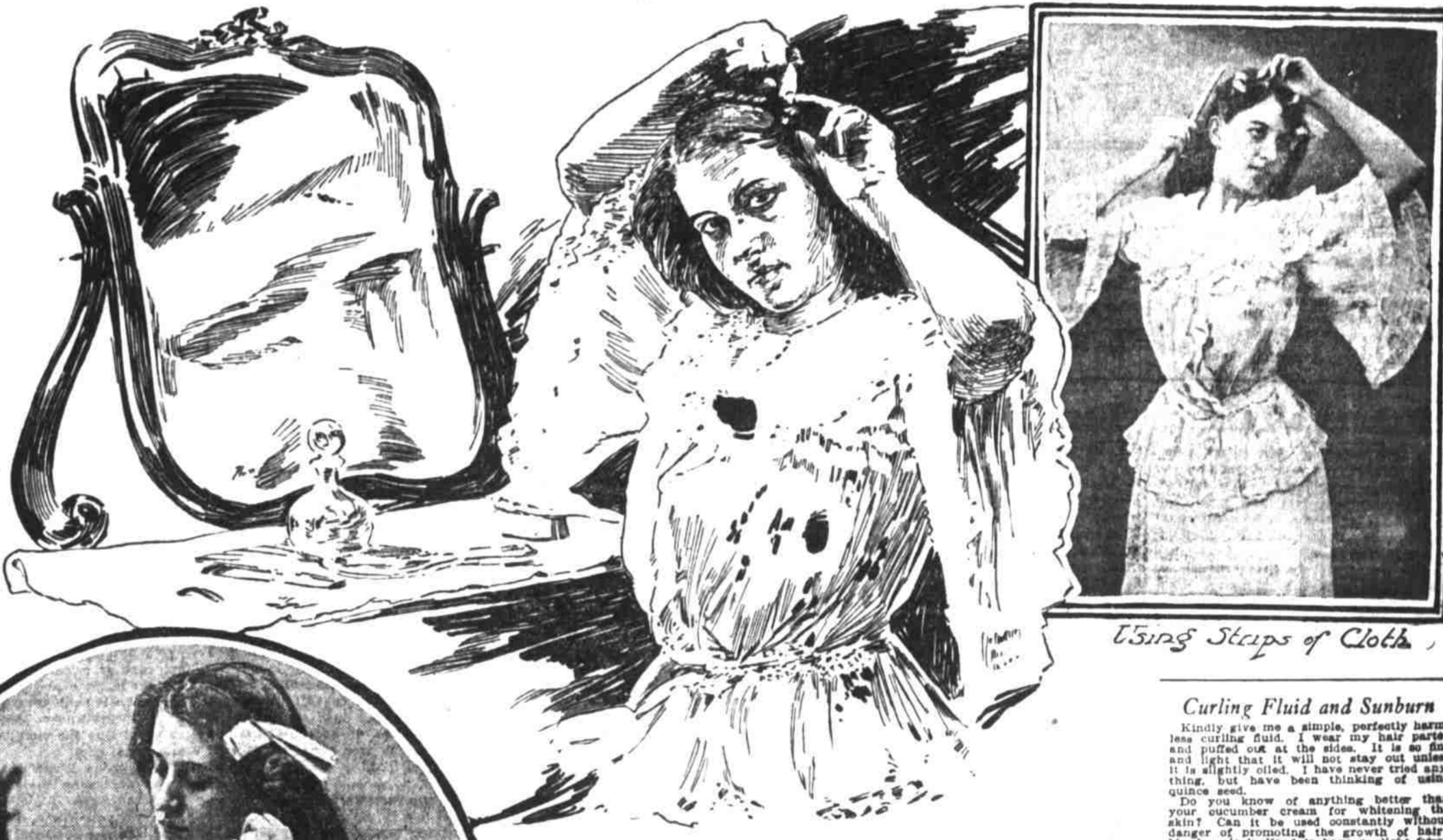
Using Straps of Cloth