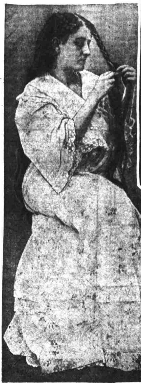
Lightly Plaiting the Hair