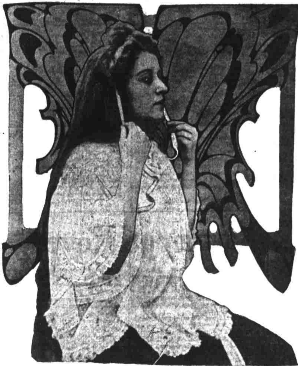
The Band Method

THE popular and pretty marcel wave is said to be bad for the hair.