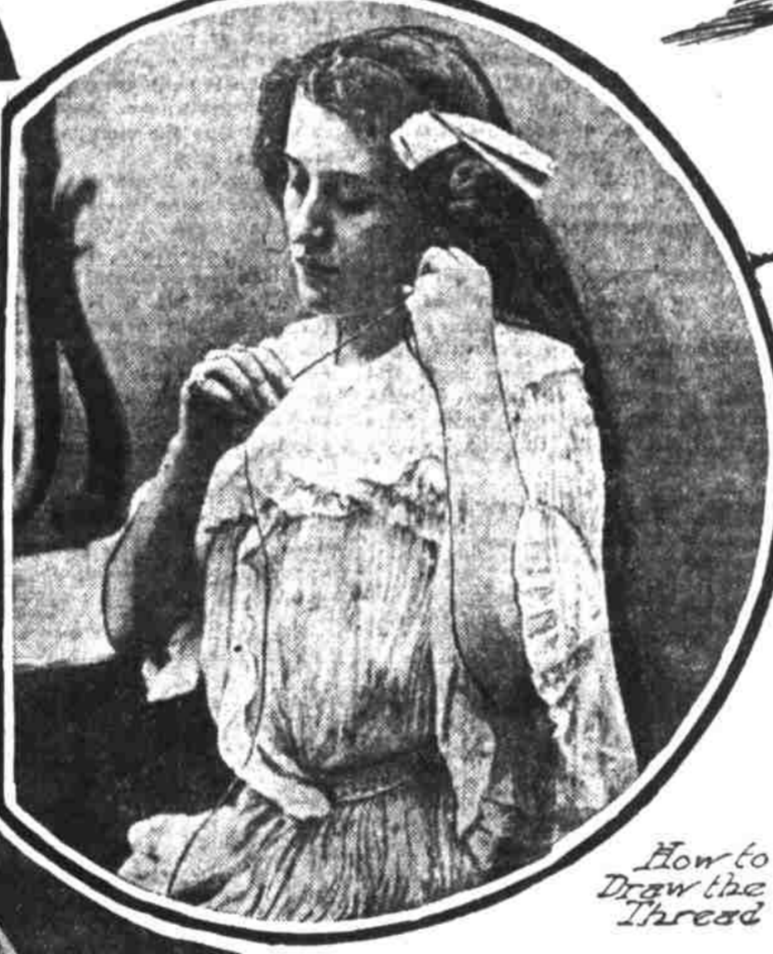
How to Draw the Thread