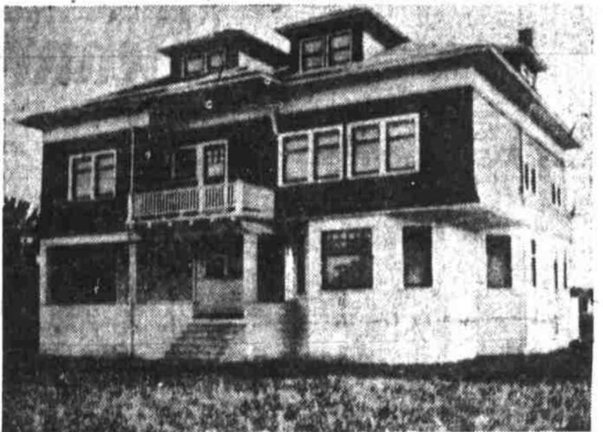
Girls' Club house, U. of O.

Library Building. One of the chief additions to the university this year is the $40,000 library building. It is well arranged and will provide many needed classrooms as well as departments for the library proper. Other buildings which are a source of pride to all lovers of the University of Oregon are the girls' club building, the first of a number of small dormitories to be erected on the campus, costing