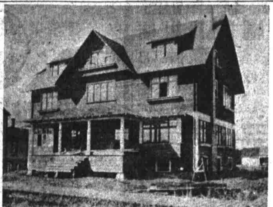
Tau Pi Sorority House, U. of O., Nearing Completion.

(Special Dispatch to The Journal.) University of Oregon, Eugene, Sept. 24.—The University of Oregon opened the first semester yesterday with the brightest prospects in its history. The faculty decided to stand behind the school solid during the trouble with the referendum, and while not quite all the additions that were hoped for have been