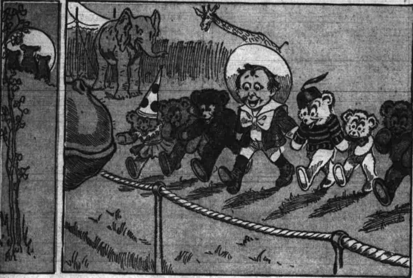
3. Then off they go, as happy as can be, The wonderful circus sights to see. You ought to see the animals laugh At the trick John played on the tall giraffe.