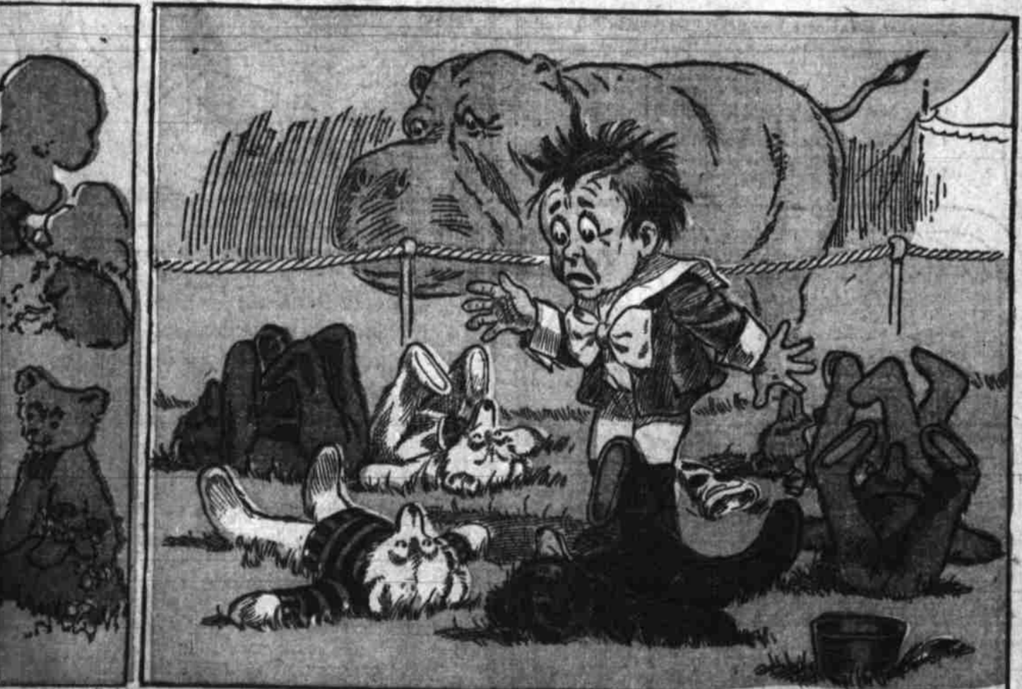
5. Poor Johnny, you see, is almost daft, And the big hippo is sorry he laughed; For there's no way to bring the Teddies around But to give them some more of the wonderful compound.