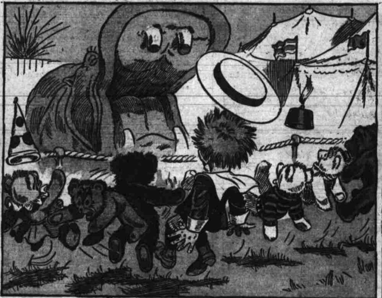
4. The hippopotamus laughed so hard He opened his mouth about a yard. The Teddies thought he was going to bite, And fainted dead away with fright.