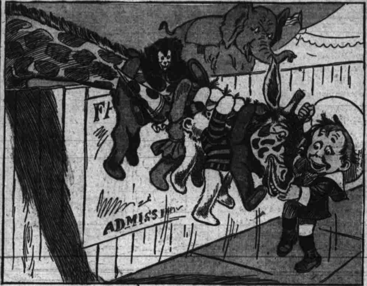
2. Johnny holds up a piece of bread; The tall giraffe pokes out his head. They grab his long, slim neck, and he Just lifts them over the fence, you see.