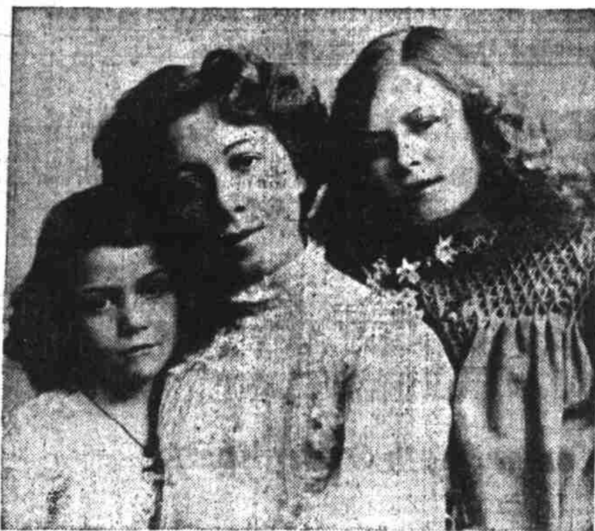
"The Prince Chap" Heroine as She Grows Up on the Stage.

In many a play the leading actress assumes several characters, but in the great comedy success, "The Prince Chap," is seen the novelty of a role requiring three actresses. The heroine grows up as the action progresses, and only an elastic lady from the museum could contract and expand to fit the requirements.