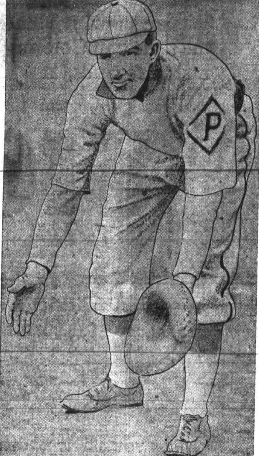
Catcher Carl Moore of Portland, Who Broke a Finger at Oakland Yes