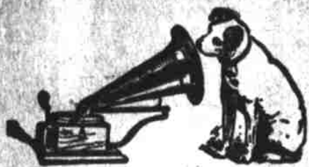
"HIS MASTER'S VOICE"