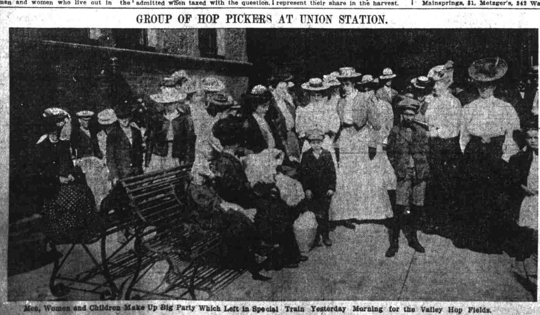
Men, Women and Children Make Up Big Party Which Left in Special Train Yesterday Morning for the Valley Hop Fields.