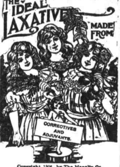
Copyright 1906, by The Man-a-Lin Co.