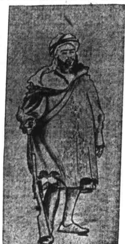
Raisul, the Bandit.