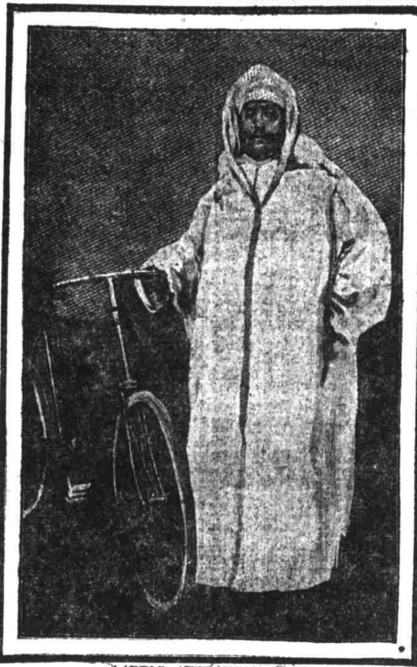
ABDUL AZIZ SULTAN OF MOROCCO