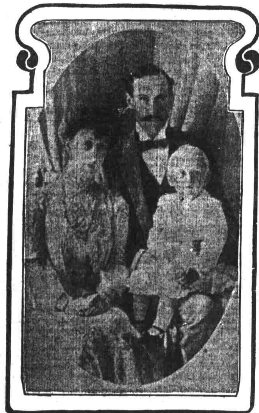
King Haakon and Queen Maud.

Monarch Beloved by Subjects Celebrates His Thirty-fifth Anniversary—Rearing for a Sailor's Life, Old Ocean Still Attracts Him.