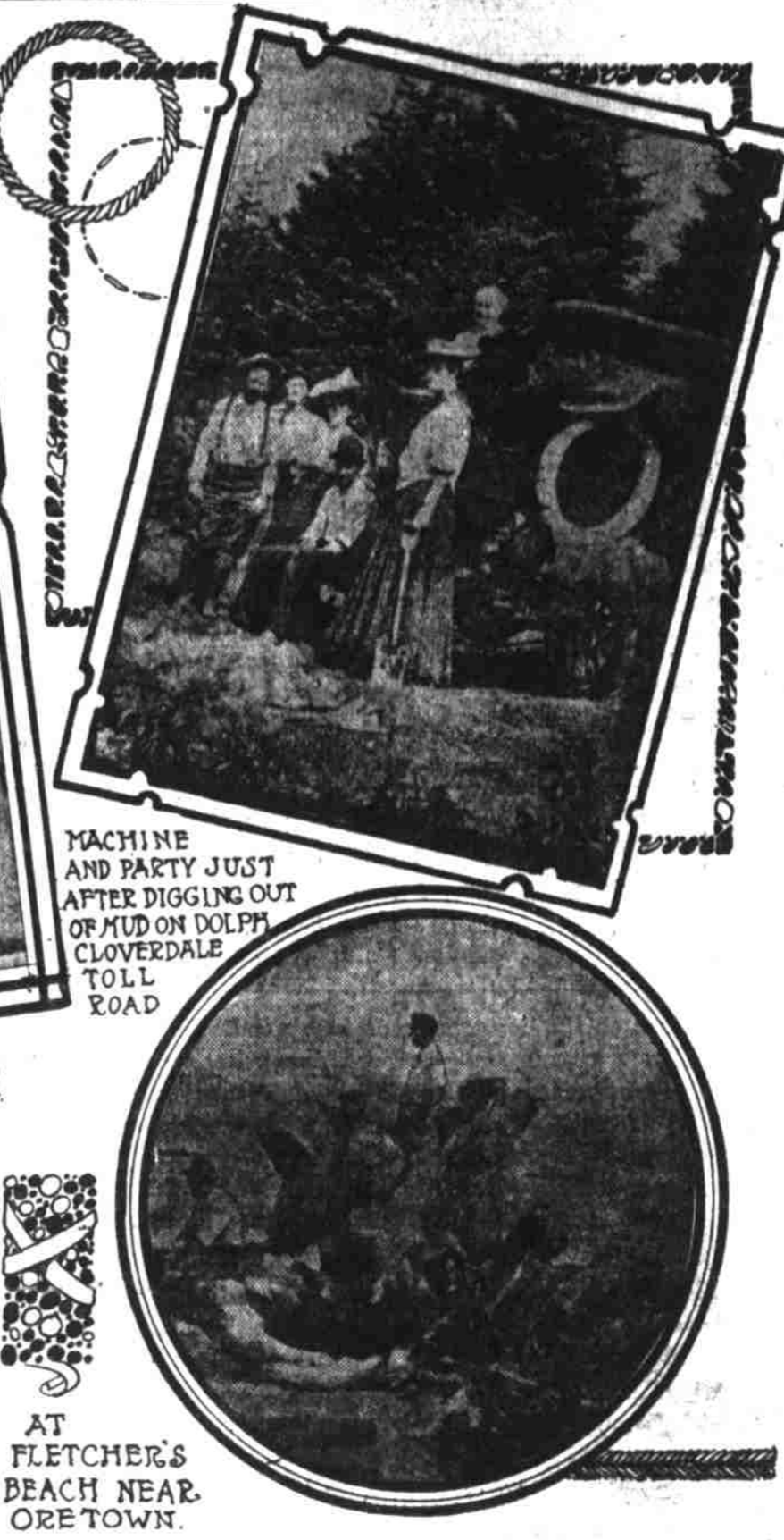
A SCENE AT FLETCHER'S BEACH NEAR ORETOWN.