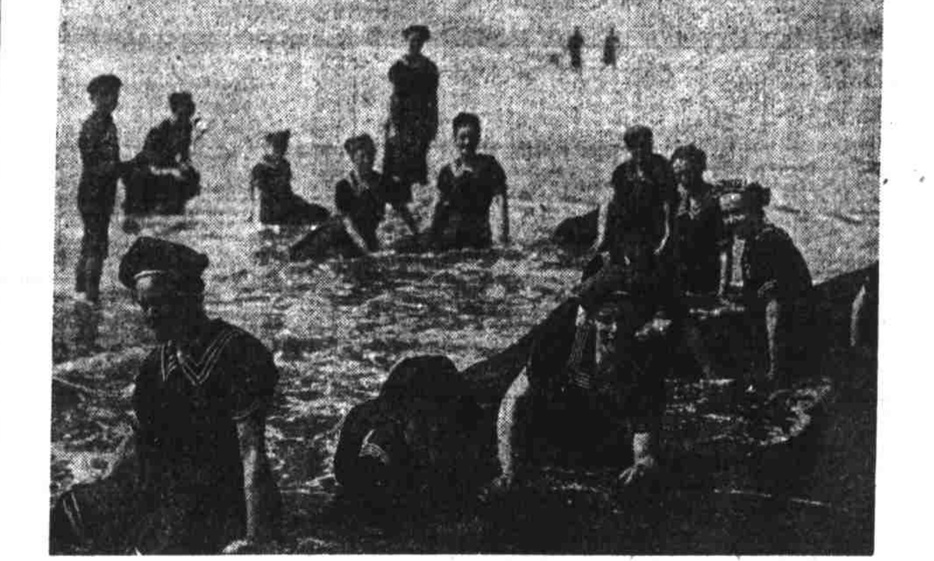
Surf Bathing Is One of the Many Attractions at the Coast Resorts.