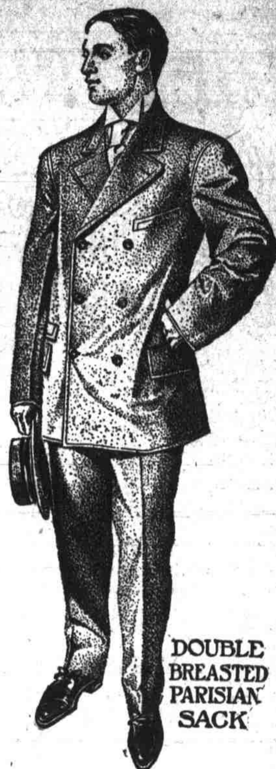
DOUBLE BREASTED PARISIAN SACK

Alterations will be made free of charge. Purchases will be charged to your account if you so desire.