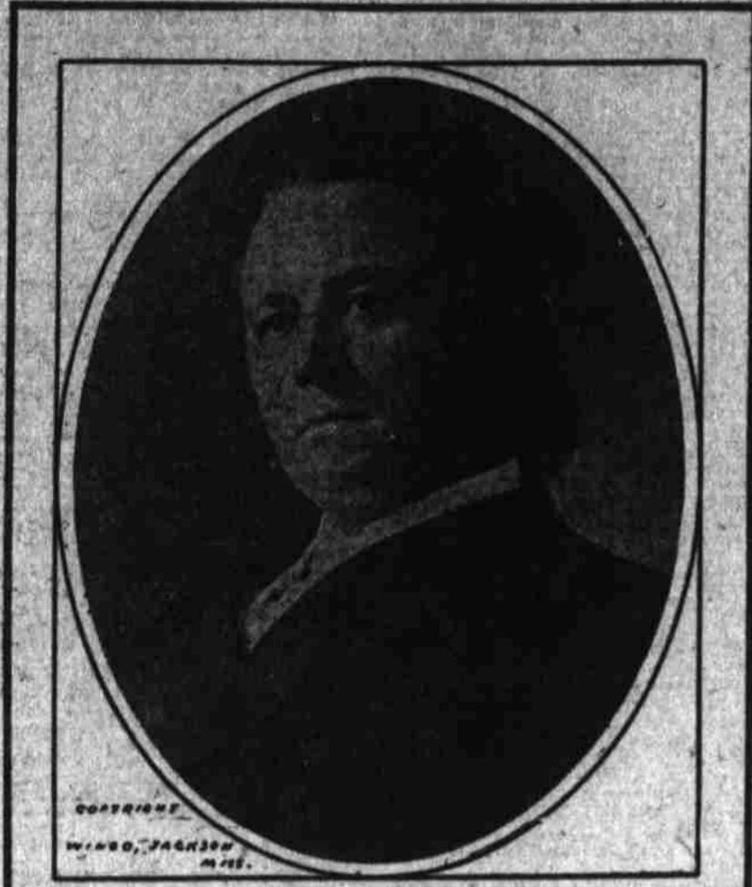
James K. Vardaman