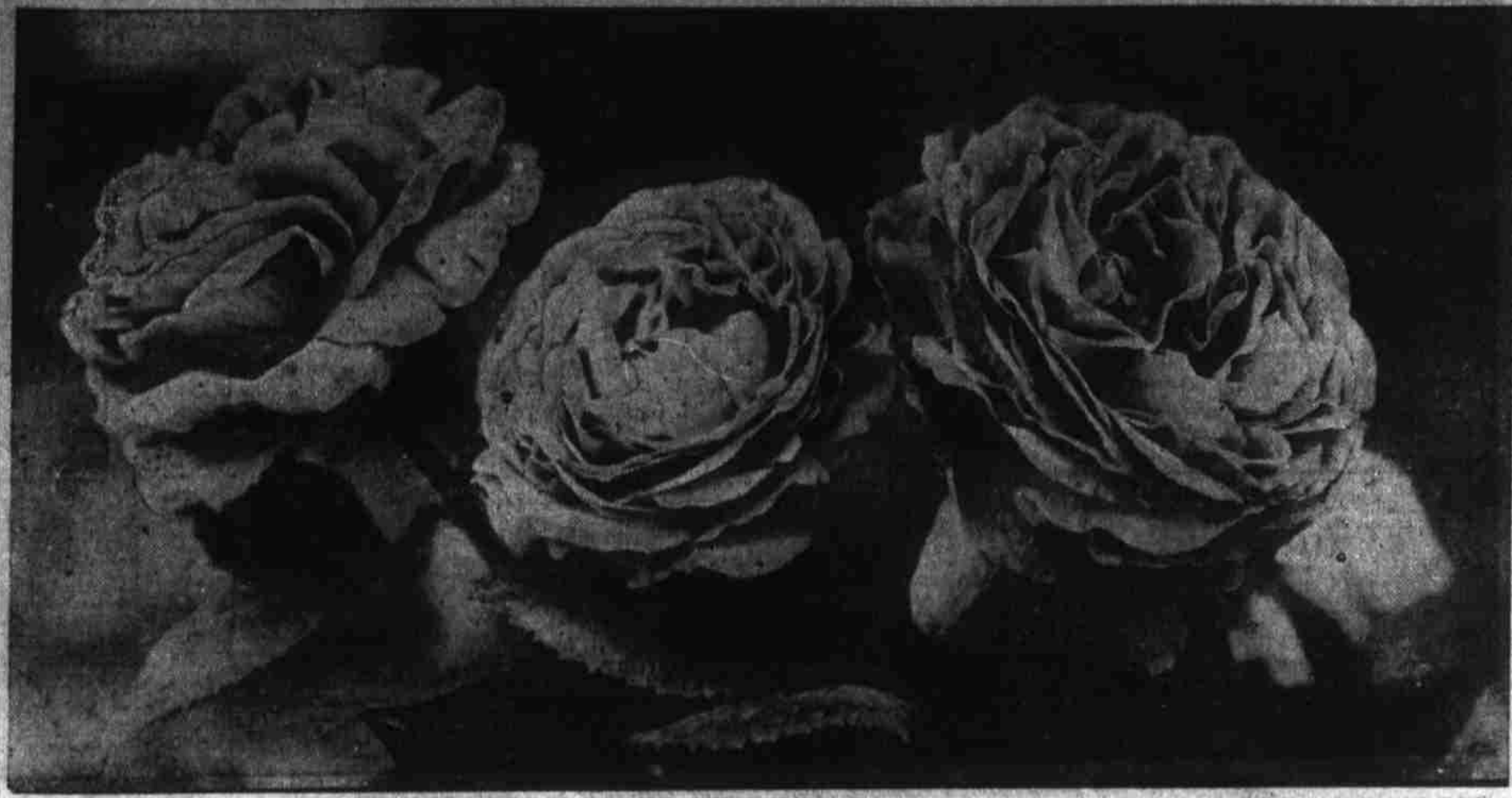
Magnificent Specimens of "Caroline Testout" Rose, Specially Photographed for The Journal.