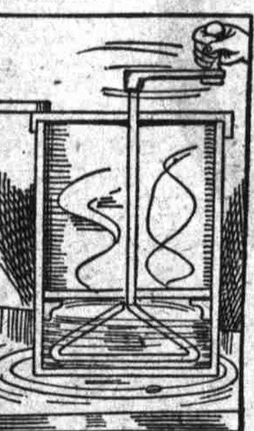
REACHES ALL CORNERS.

Simple Device for Stirring Hot Liquids on the Fire. Egg-and-cake beaters of innumerable styles and shapes have been invented to take the place of the tedious beating