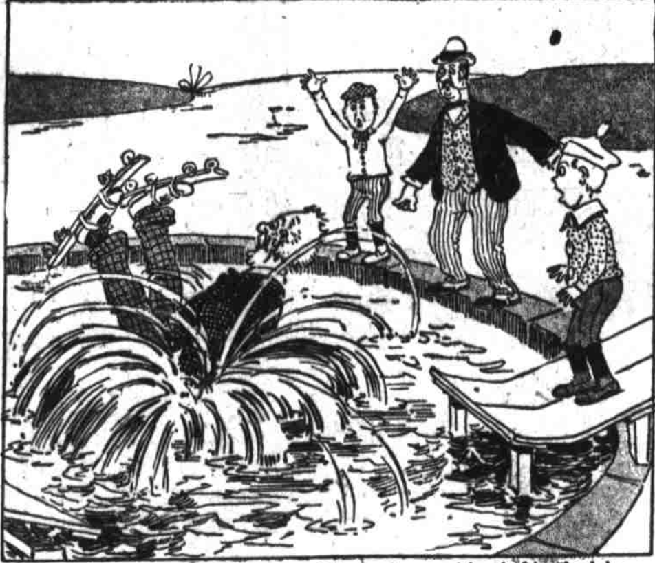
But he didn't know anything about roller skating, and landed in the lake.