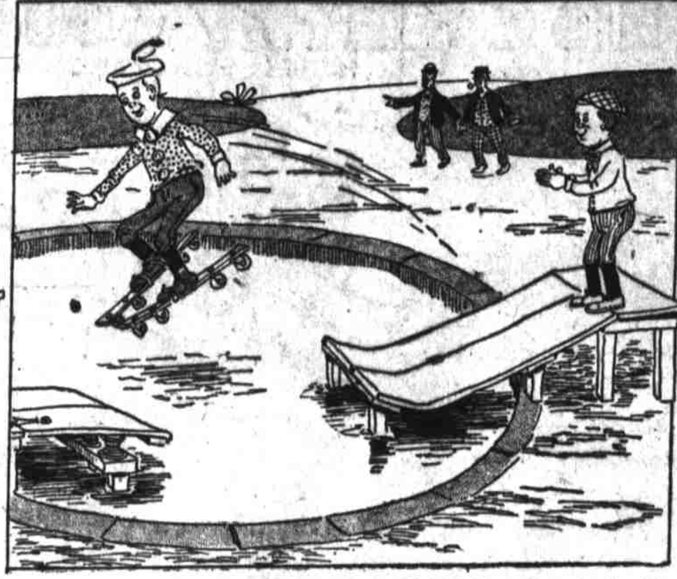
Then we built a ski-jumping outfit on the artificial lake and made the skis out of roller skates.