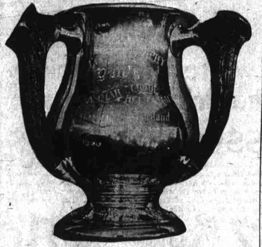
Grammar School Relay Trophy.

As the suspension bridge at Oregon City is out of commission, Saturday's grammar school relay race will start from the west end of the bridge instead of the Clackamas county courthouse.