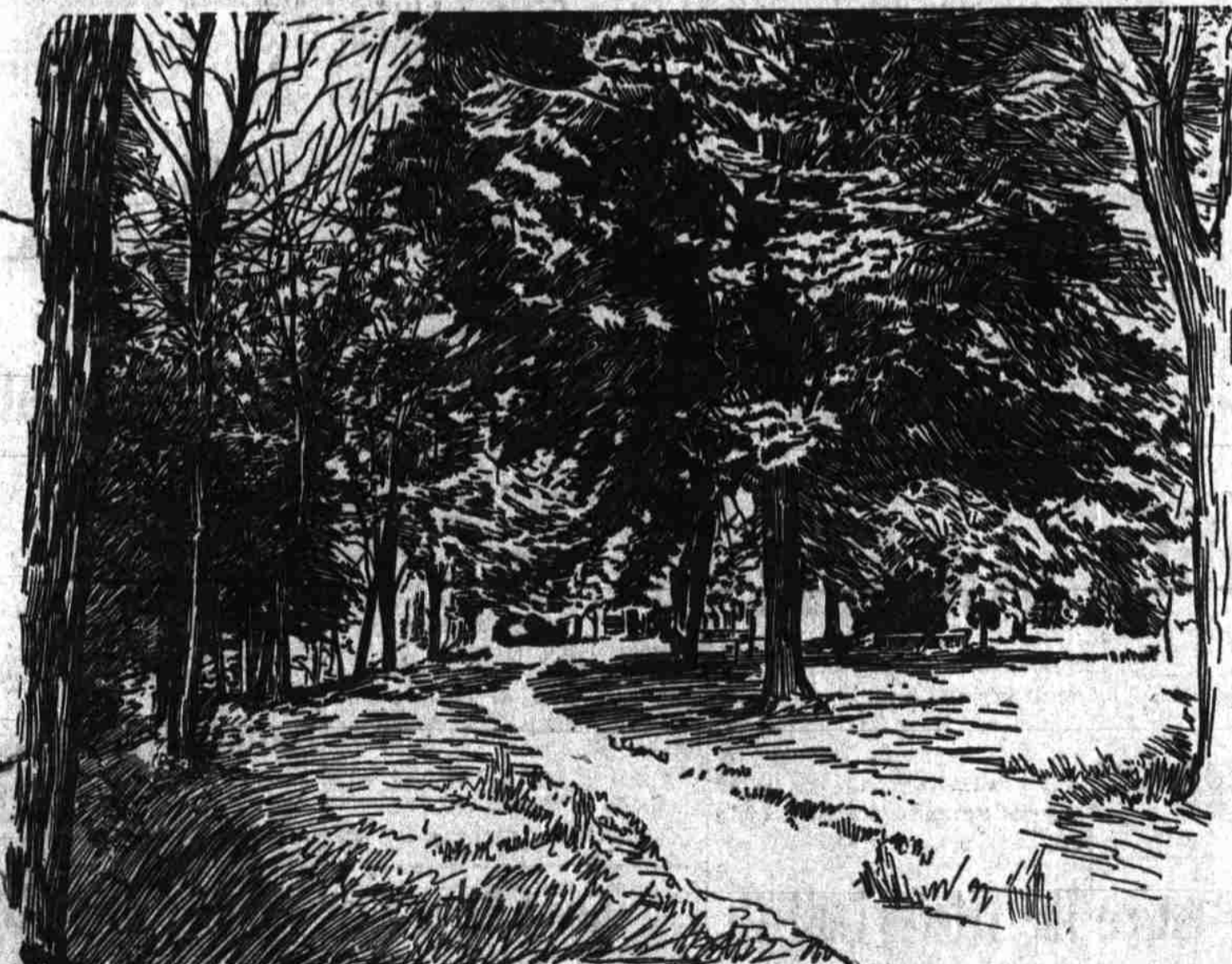
VIEW IN SHADY WOOD PARK AT LENTS.

An addition in the most desirable residence district of Lents. This offer is made to call the attention of a great number of people to the remaining lots of this tract. Take the pleasant car ride on the Oregon Water Power's palatial coaches to Lents and see both the beautiful lots and beautiful paintings. The giving of a valuable framed oil painting with each lot does not mean that the price of the lots has been advanced. The paintings embrace a variety of subjects, among them a picture of Thunder Mountain, Idaho, a new canvas of this majestic mountain scenery that has received much favorable comment. The pictures run in size from 18x24 up. On exhibition every day at