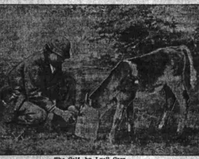
The Calf, by Lyell Carr.

The feast is now spread for all lovers of fine art and devotees of the beautiful in crafts at the Art Museum, Fifth and Taylor streets. The display of the arts and crafts which is in place in the upper rooms includes many of the choicest treasures from Portland homes as well as a portion of the exhibit recently made at Copley Hall, Boston, under the auspices of the Arts and Crafts society.