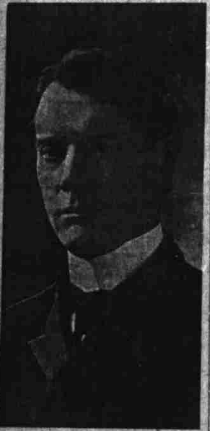
Senator Albert J. Beveridge of Indiana, Roosevelt's Defender.

(Publishers' Press by Special Leased Wire.) Galena, Ill., April 27.—A defense of President Roosevelt by Senator Beveridge and a comparison of the attacks on Washington, Jackson, Lincoln and Grant were the features of the U. S. Grant birthday celebration here today. Beveridge went after Colonel George