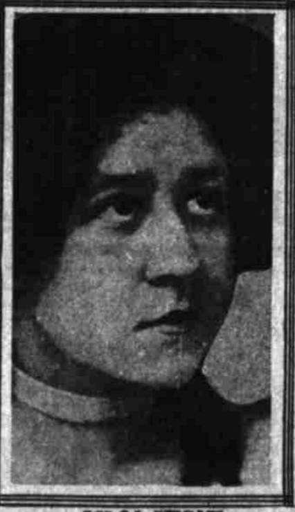
MISS VERNA FELTON