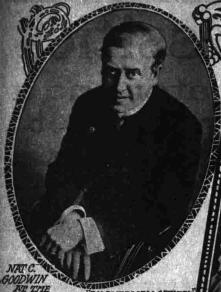
NAT C. GOODWIN AT THE HELLIG

"AN AMERICAN CITIZEN" TUES. NIGHT APR. 23 "WHEN WE WERE TWENTY ONE" WED. NIGHT APR. 24