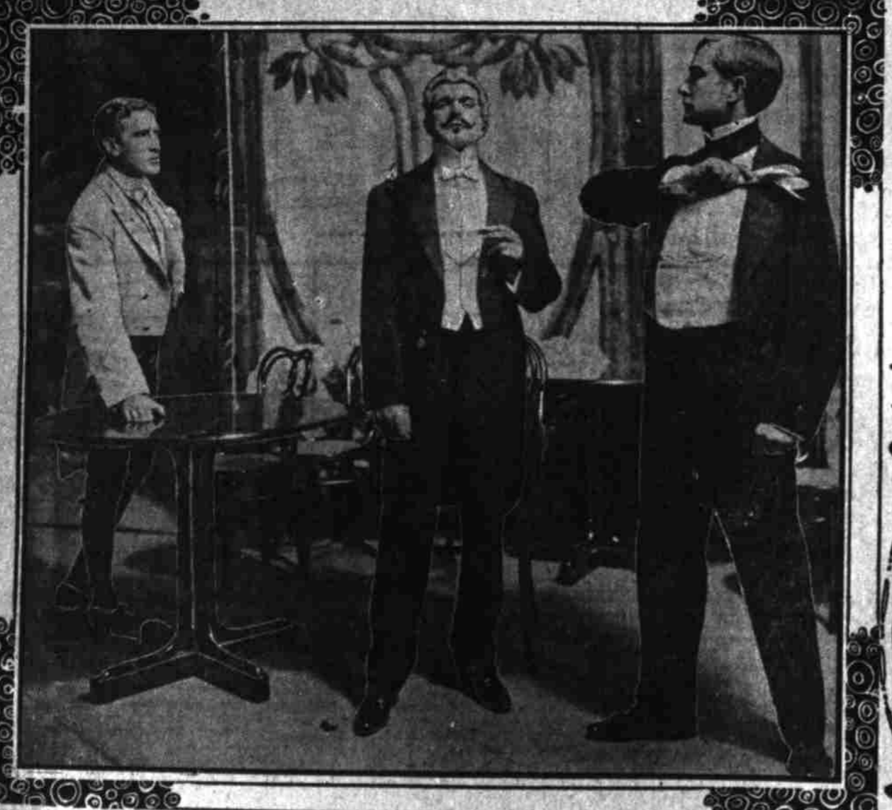
SCENE FROM ACT 3 OF "THE PRODIGAL SON" AT THE BAKER.