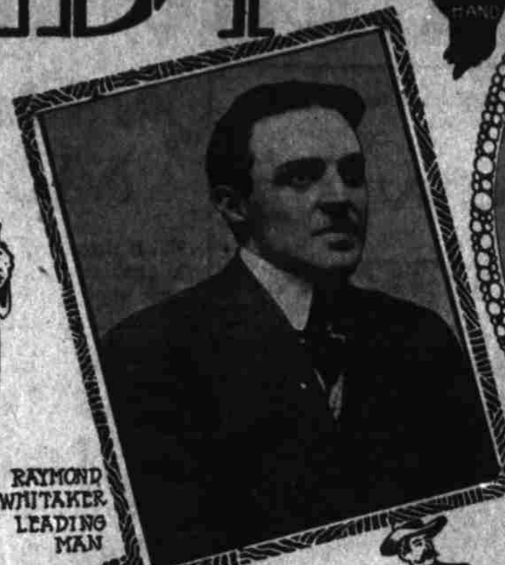
RAYMOND WHITAKER LEADING MAN

RAYMOND HITCHCOCK IN THE COMIC OPERA "THE YANKEE TOURIST" AT THE HELLIG