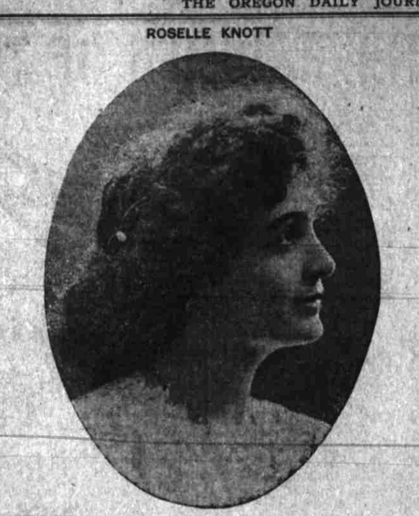
The Charming Actress Who Begins an Engagement at The Heddis Theatre Tonight.

Sleet at Gray's Harbor. Hoquiam, Wash., March 21.—Gray's Harbor has experienced a hard down-pour of rain during the past 24 hours and today sleet is falling. The thermometer is much lower than usual.