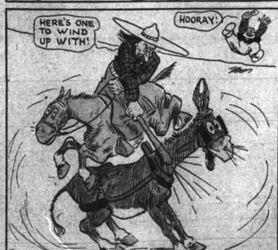
HERE'S ONE TO WIND UP WITH! HOORAY!