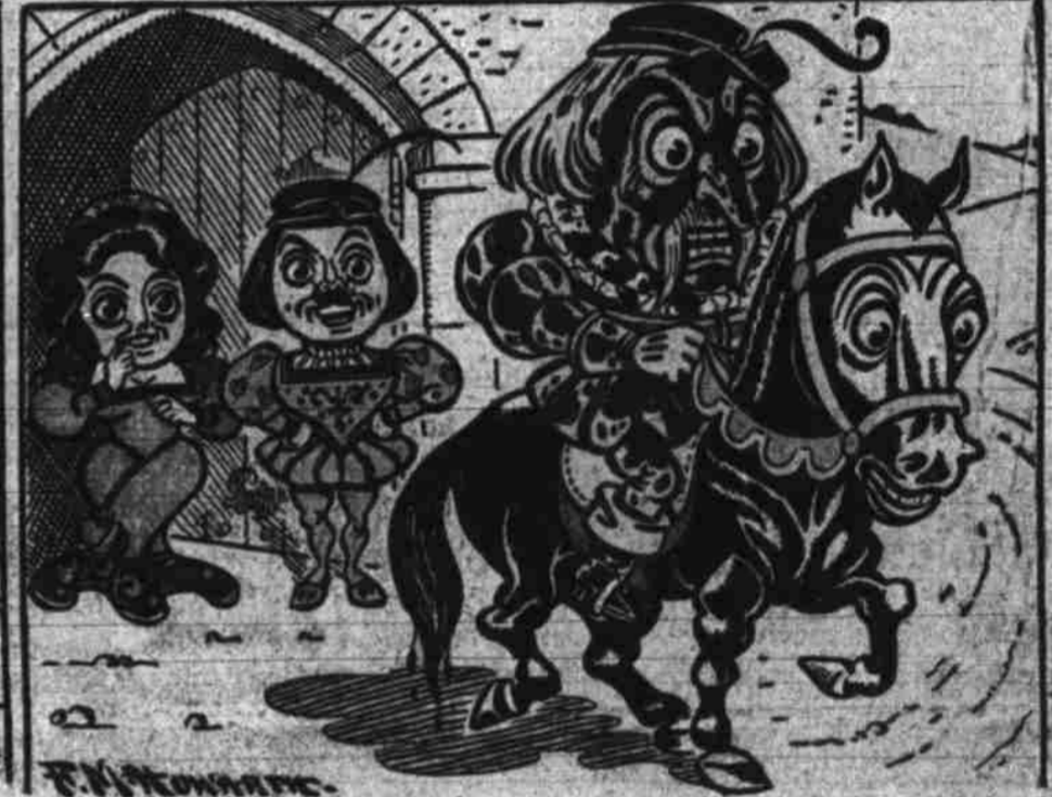
6. ISABEL: "Well, good day, Duke. Thy painting lesson was certainly a novel entertainment." ALONZO: "Why not tarry, my lord? The Earl would be glad to see thee, I'm sure." DUKE OF GILTROCKS: "By St. George! I'm bewitched, of a surety! S'death! If I find out the varlet who putteth these spells upon me!"

Great Britain Rights Reserved.