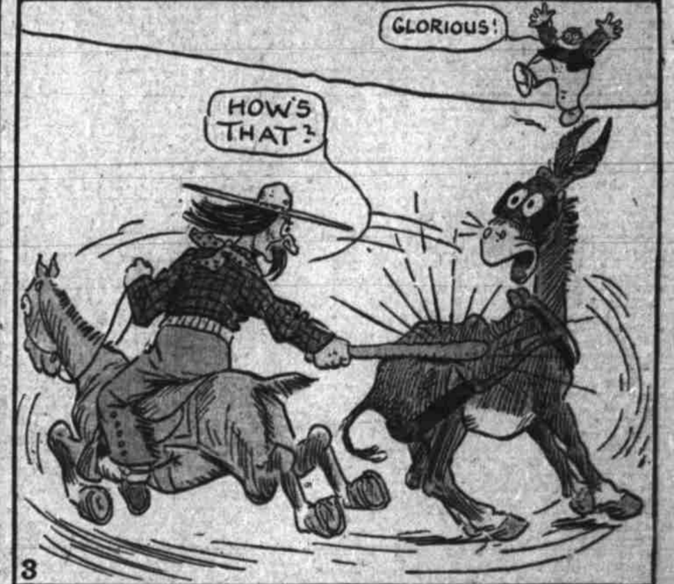
GLORIOUS! HOW'S THAT?