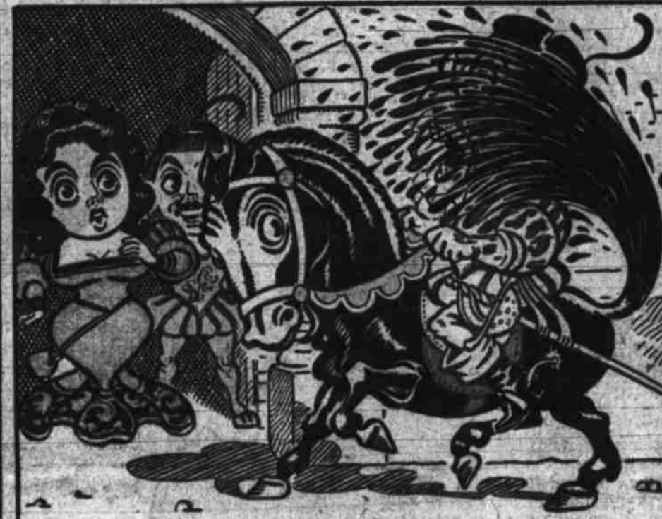
5. THE HORSE: "Darn that fly! SWISH!" DUKE OF GILTROCKS: "WEOW! The flood has come! Ye gods! I am undone!" ISABEL: "By my faith, but the Duke carries a peculiar paint brush."