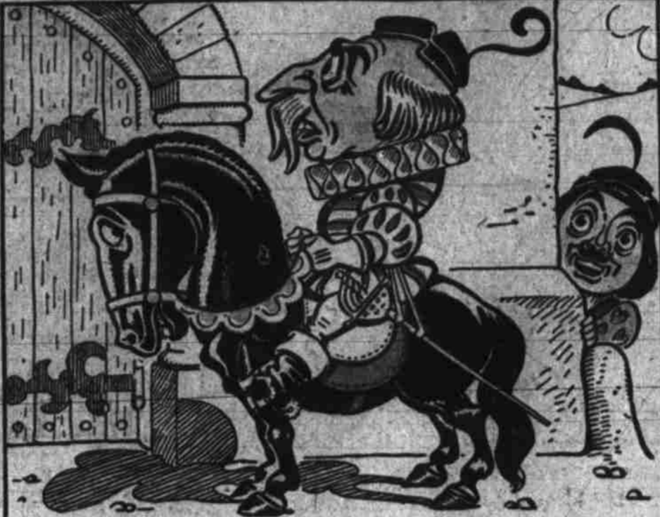
2. DUKE OF GILTROCKS: "Ho, within there! Warder, halberdier, varlets, open the gate to admit the valiant and courtly Duke of Giltrocks, suitor to the hand of thy mistress, fair Isabel!" ALONZO: "By Venust! Methinks I see a method that will settle him."