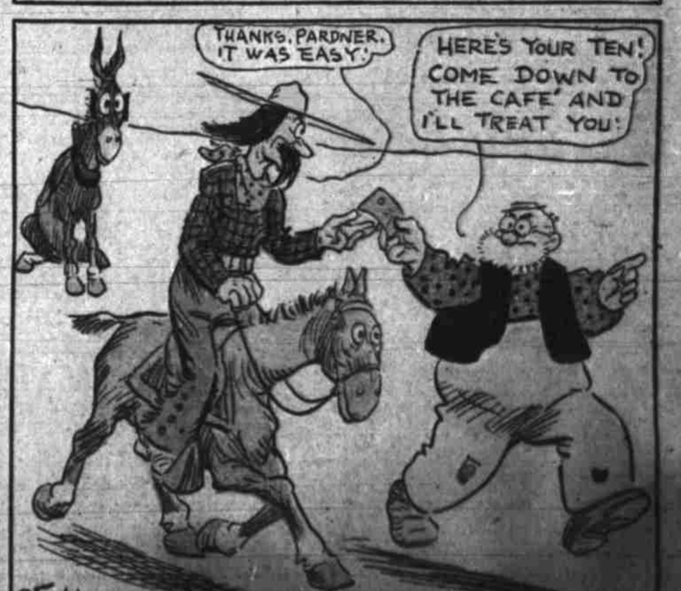
THANKS, PARTNER. IT WAS EASY! HERE'S YOUR TEN! COME DOWN TO THE CAFE AND I'LL TREAT YOU!