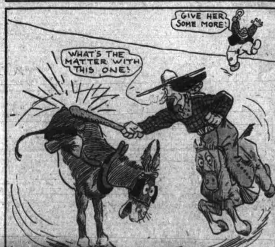
GIVE HER SOME MORE! WHAT'S THE MATTER WITH THIS ONE!