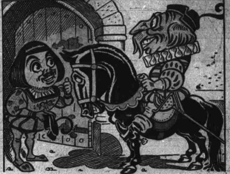
3. DUKE OF GILTROCKS: "Ho, ho, ho, HO! Dost not hear me within? By my halldoms, thy tardiness and neglect I will this day report unto your master, the Earl. Open the gates, I say!" ALONZO (aside): "This paint will not do a thing when the horse swishes his tail at a fly."