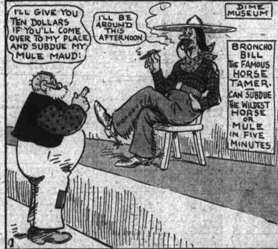
I'LL GIVE YOU TEN DOLLARS IF YOU'LL COME OVER TO MY PLACE AND SUBDUCE MY MULE MAUD! I'LL BE AROUND THIS AFTERNOON. DIME MUSEUM BRONCHO BILL THE FAMOUS HORSE TAMER CAN SUBDUCE THE WILDEST HORSE OR MULE IN FIVE MINUTES