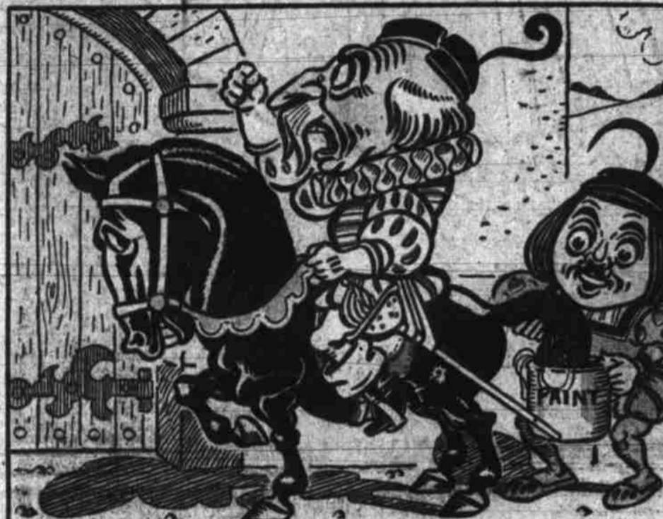
4. ALONZO: "We beg your Grace's patience. My fair mistress cometh, but she requests that you remain upon your beautiful charger, so that she may admire the noble beast and your dignified men and bearing." DUKE OF GILTROCKS: "Gadzooks! I believe I win her at last!"