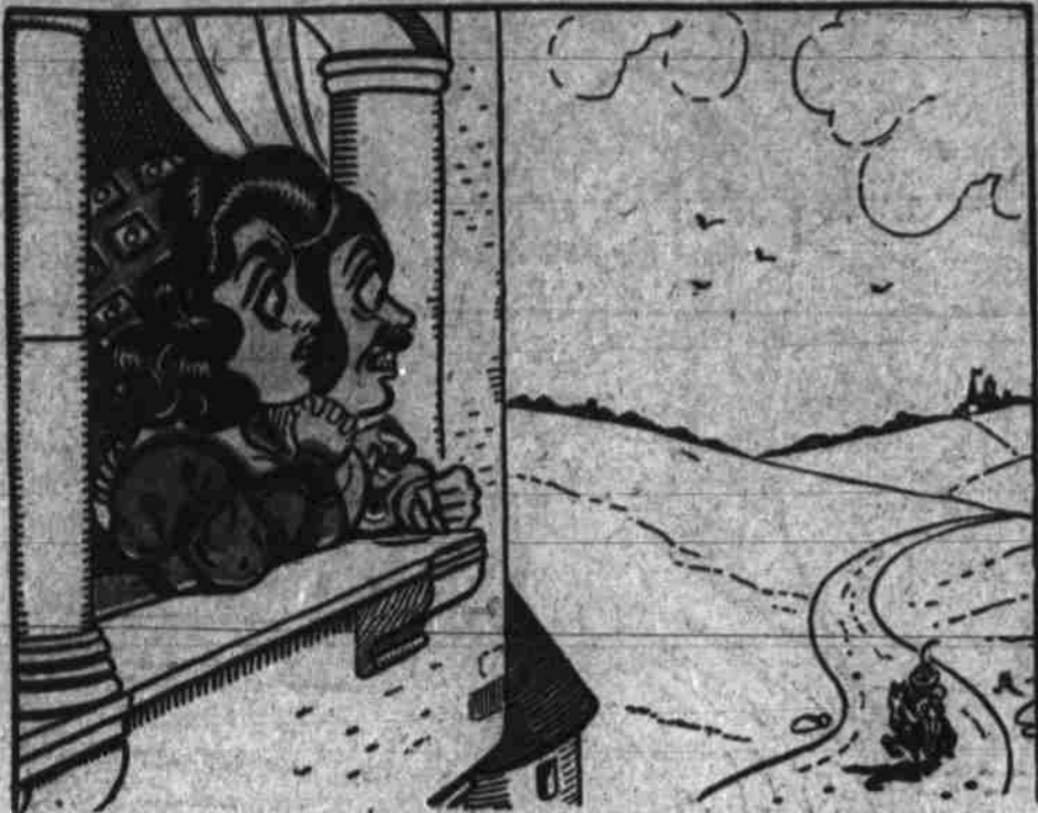
1. ISABEL: "Oh, Alonzo, look! See, the Duke of Giltrocks comes again to force his suit upon me. Oh, can't you get rid of him before he has a chance to make his proposal?" ALONZO: "By my faith, I will. How I do not know, but my love for thee will find a way."

Copyrighted, 1907, by the American-Journal-Examiner. Great Britain Rights Reserved.