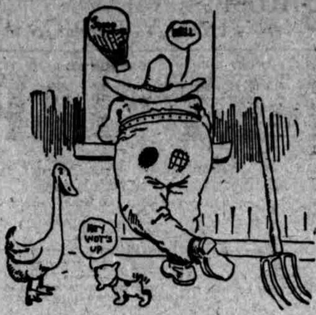
TO GRAB OR NOT TO GRAB.

That Jim Jeffries is to reenter the ring, tempted by the purse of $50,000 offered for him to fight, seems certain. In the opinion of experts, Arthur Johnson, the big negro, appears to be the only contestant now in sight who is likely to give Jim sufficient of an argument to draw a crowd warranting the offering of such a purse.