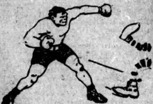
THEM AGAIN JEFF MIGHT UNBUTTON A LEFT AND MAKE AN A-LA-MUNROE.