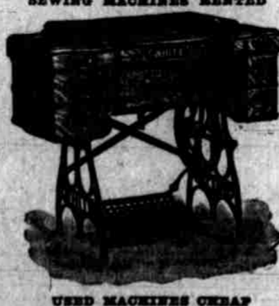
SEWING MACHINES RENTED

280 Yamhill St., Cor. Fourth Phone Main 6102