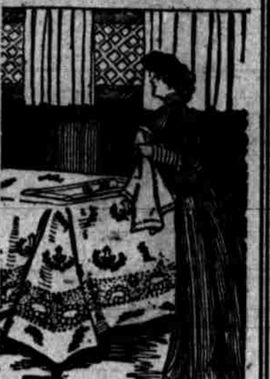
See the Big Fifth Street Window Display

Three great special lots of Renaissance pieces on sale for Tomorrow's 879th Friday Surprise Sale at temptingly low prices—Handsome pieces in large assortment and marvelous values. LOT 1—Choice Renaissance Dresser and Bureau Scarfs, 18x54 and 20x54-inch oblong, square, round and octagon medallion centers, $2.50 to $4.00 values at $1.59 the extremely low price of, ea LOT 2—Choice Renaissance centers, 18-inch size, round and square, good assortment of patterns, 75c to $1.25 values at the very low price of, ea 47c LOT 3—Choice Renaissance pieces, 12-inch size, round and square, all new patterns, our regular 50c and 60c values at the very low price of, ea 23c