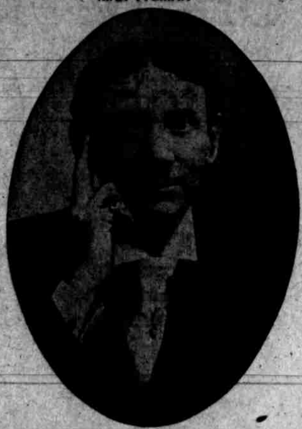
The Favorite Comedian, Who Is Playing an Engagement at the Helig Theatre, in the Delightful Comedy "The Man on the Box."

Railroad company is again operating its overland trains from the sound to St. Paul, and trains are overloaded with traffic of all kinds. The line between Portland and Seattle is clearing away large accumulations of freight and baggage that were piled up in Portland, awaiting transportation to sound points.