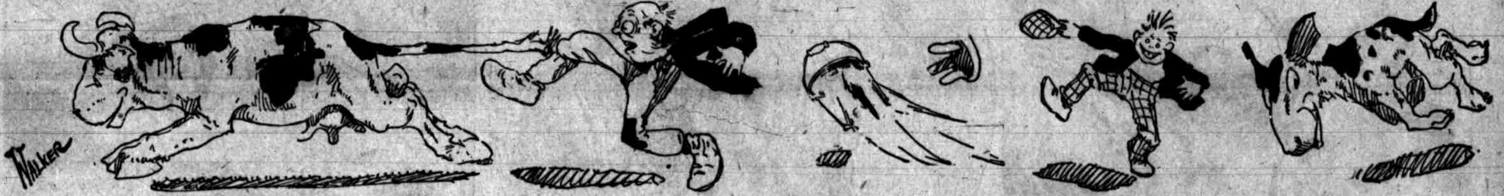
It banged holes in the walls and furniture, and Papa blamed it all on me when it was Jim's fault. Yours, Willie.