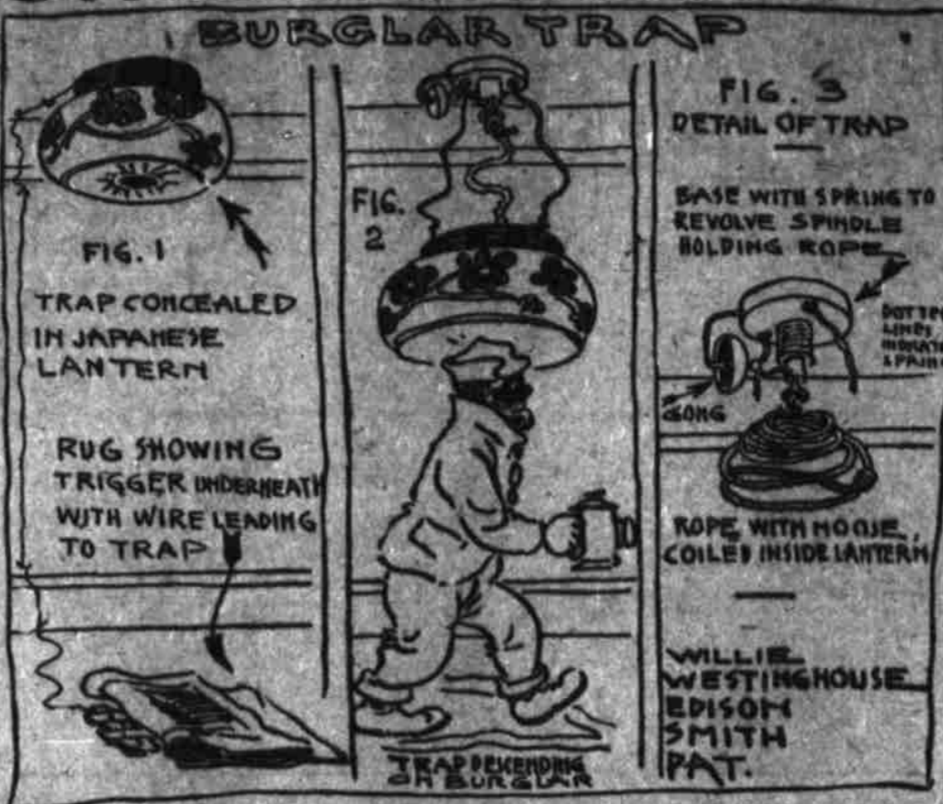
Then I got busy and made a burglar trap like this.