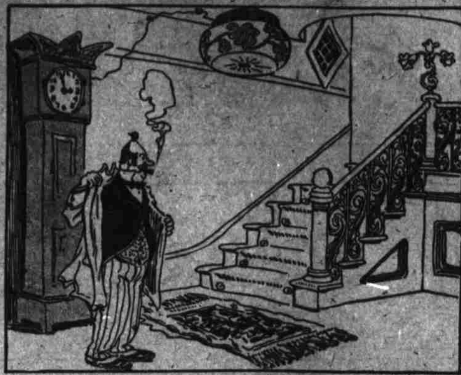
The first night I tried it I forgot it was Papa's lodge night until I heard the front door slam.