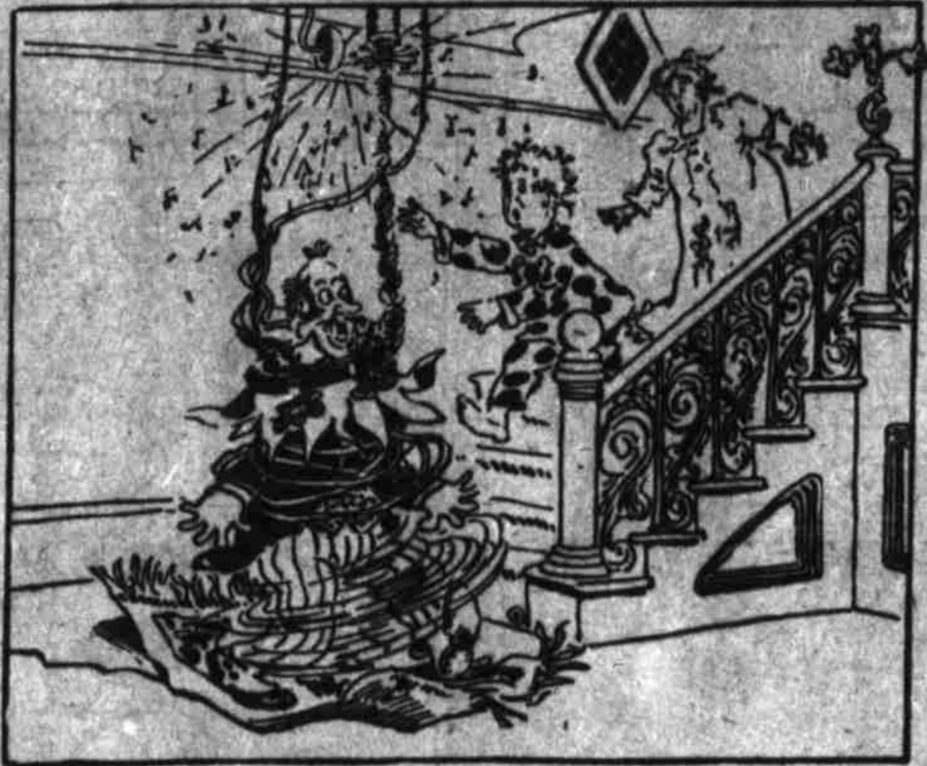
My, but it had him wound up tight!