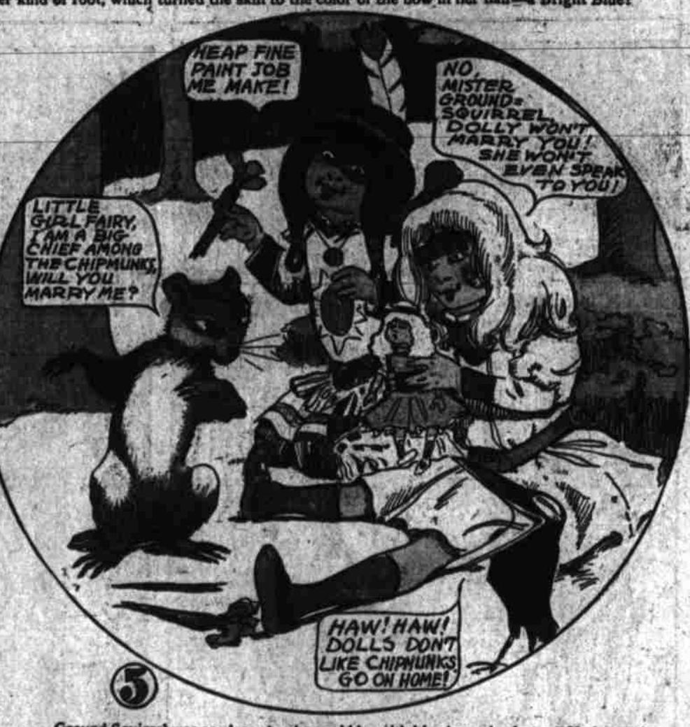
Ground Squirrel was as pleased as he could be with his nice striped cost. He bowed to the little Dolly, and, putting his hand on his heart, asked her if she'd marry him! But the Dolly only stared and said not a word! It tickled Aundak, the Crow, so much that he had to laugh right out, but is made Chin.

It tickled Aundak, the Crow, so much that he had to laugh right out, but it made Chipmunk quite angry to get no answer at all, so-