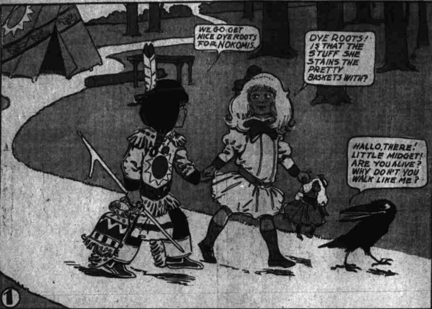
A few days after Nokomis had brought Little Growling Bird and Fanny Yellow Hair from the Indian village back to the Wigwam in Windego Land she thought she would make some baskets and other pretty things to please the little White Girl. She found, however, that she had no colors to paint the pretty stripes and figures on the things she wished to make. Big Bear was not around just then, so she asked Little Growling Bird to get her some of the nice Paint Roots that grew in the woods near the Wigwam. Aundak, the Crow, knew all about the places where such things grew, so off he started, saying he would show the way.