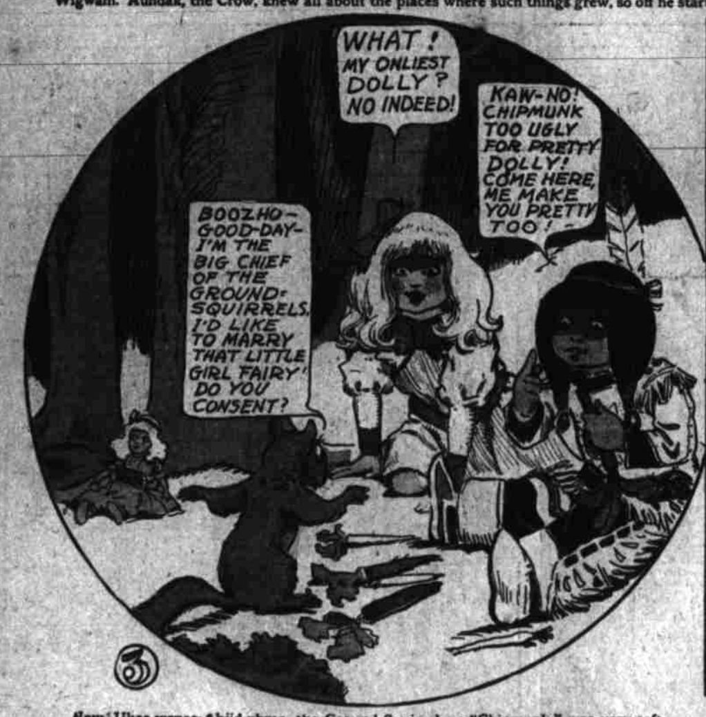
Aow, Ukee-wenee Ahjid-uhmo, the Ground Squirrel, or "Chipmunk," was very soft-hearted, and as soon as he cast eyes on the pretty Dolly, he thought he had never seen anything so beautiful in his life and fell in love with her on the spot! He came out of his hole and very politely asked Little Growling Bird if he might have the little "Girl Fairy" for his wife!