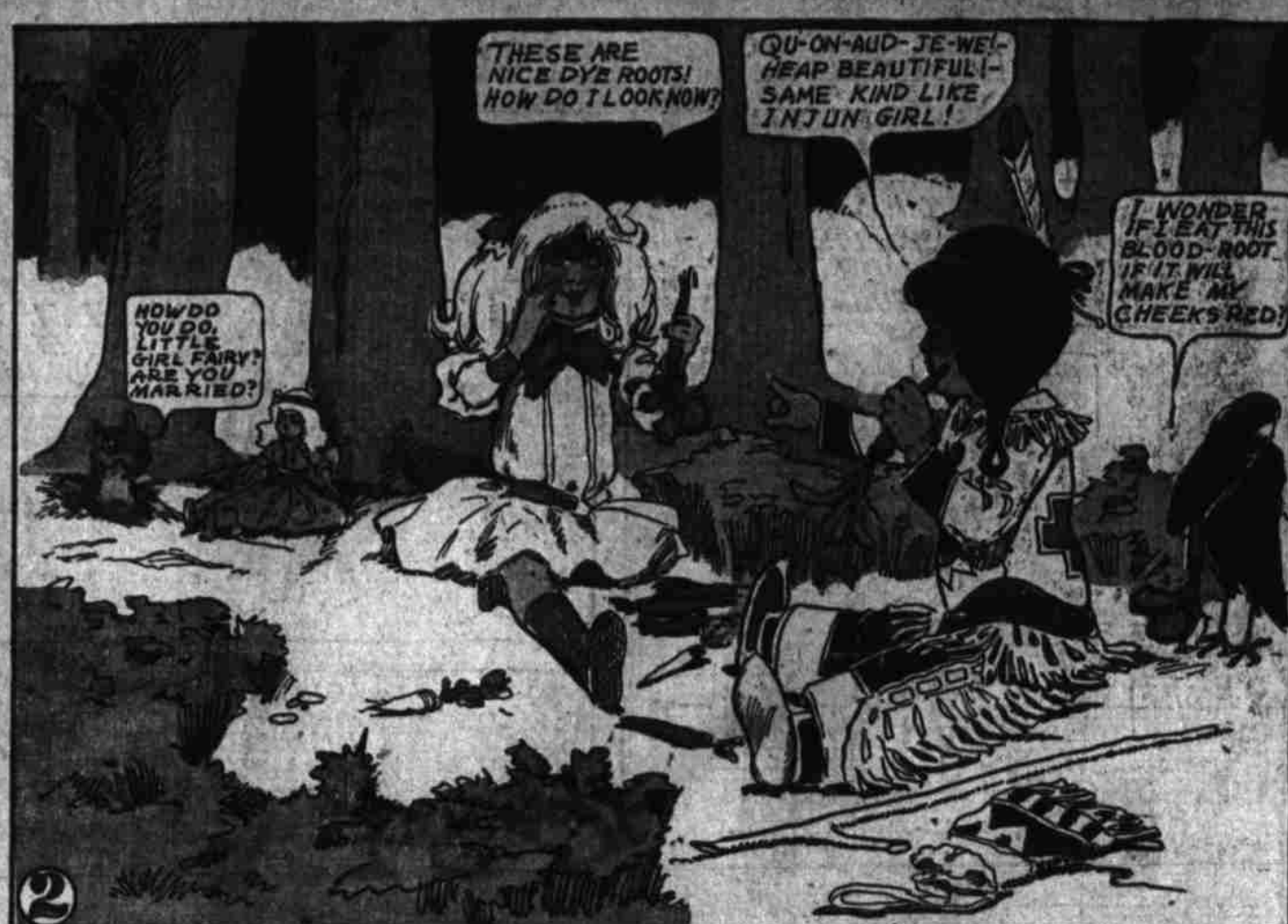
They soon came to the place where the Paint Roots grew and Little Growling Bird dug up a good supply. Yellow Hair wanted to know how the Indians got the dye-stuff out of the roots, and the little boy showed her how to crush them and get the juice out. Then he took a queer-looking root and rubbed it on the upper part of his face, which soon turned to a Bright Green color! Yellow Hair thought that was fine fun, and began painting her own cheeks with the juice of a bright scarlet root. Then she painted her forehead with another kind of root, which turned the skin to the color of the bow in her hair—a Bright Blue!