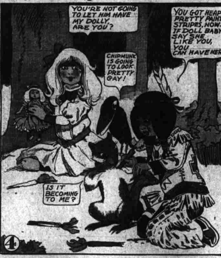
Fanny Yellow Hair was afraid that the little boy might give her pretty Dolly to Mr. Ground Squirrel, so she grabbed her up very quickly. But Little Growling Bird thought it would be great fun to play a joke on Chipmunk, so he told him that he was too homely for such a pretty "Girl Fairy." Then he began to make broad stripes down Chipmunk's back with the Paint Roots, and—