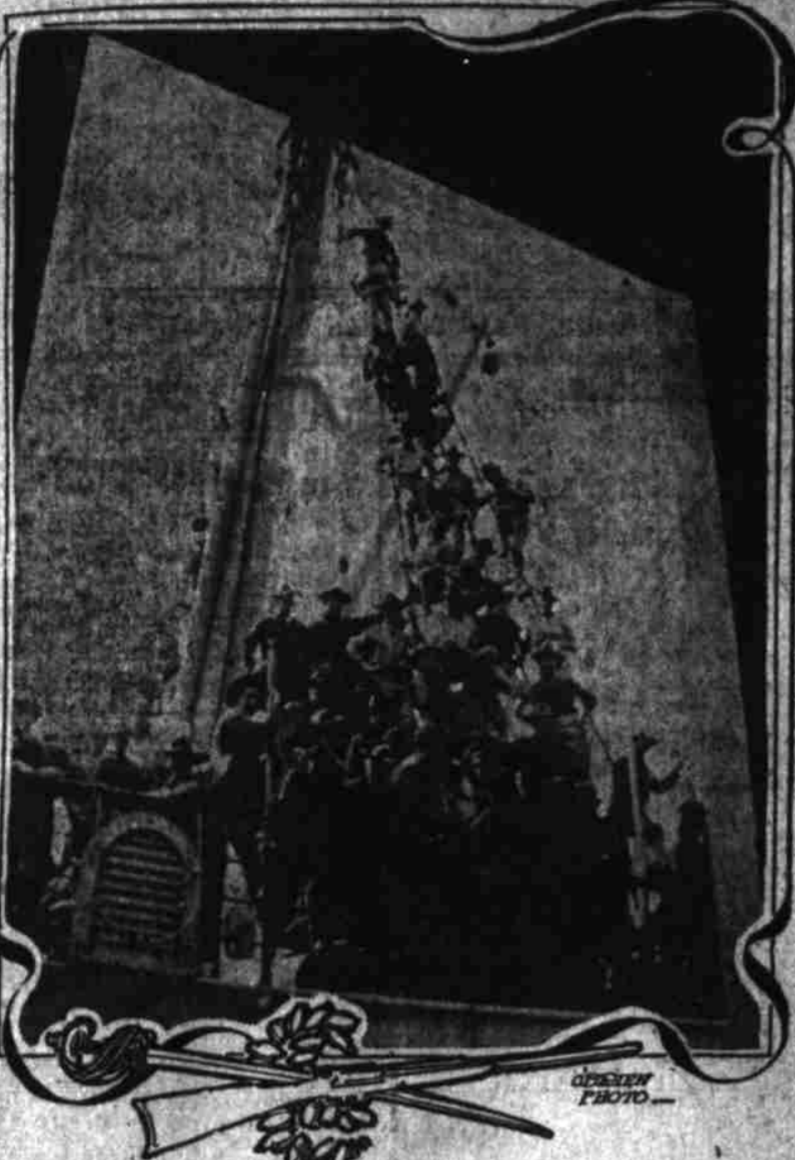
The Transport Sumner, which sailed from Brooklyn, with nine hundred United States soldiers aboard, all splendidly equipped for work in Cuba. The picture shows the men in the rigging, waving their good-bys.