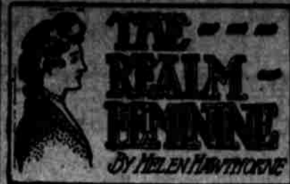
American Girl's Fan.