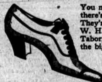
at little or nothing.

Two Oxford Specials $1.69 for $3.50 to $5 Oxfords