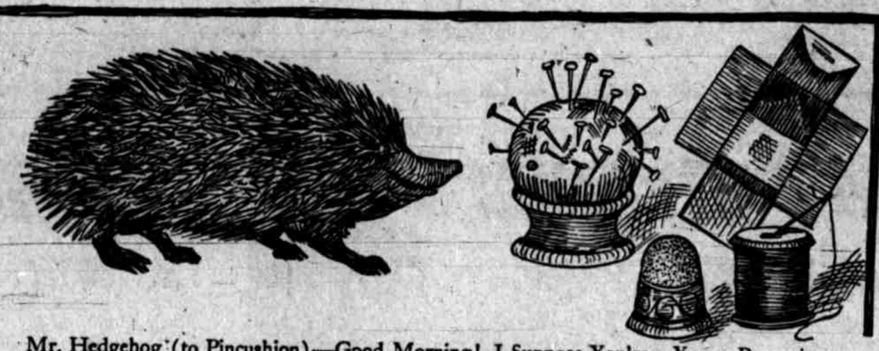
Mr. Hedgehog (to Pincushion)—Good Morning! I Suppose You're a Young Porcupine.

An interesting experiment has been tried by a well-known naturalist. Having caught a number of bees as they hovered about a hive, he placed them in a light receptacle.