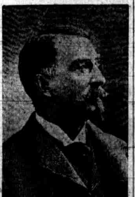
Colonel Henry A. DuPont, Delaware's New Senator-Elect.