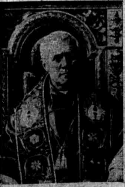
Pope Pius X.