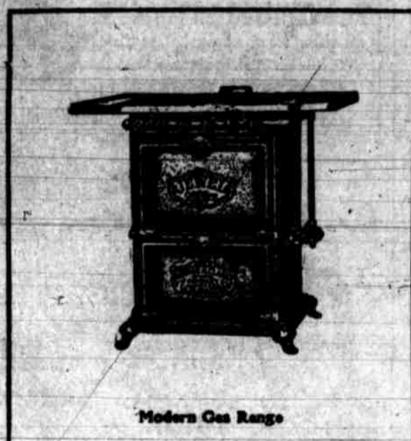
Modern Gas Range

No Wood or Coal to Carry No Baking Hot Kitchen