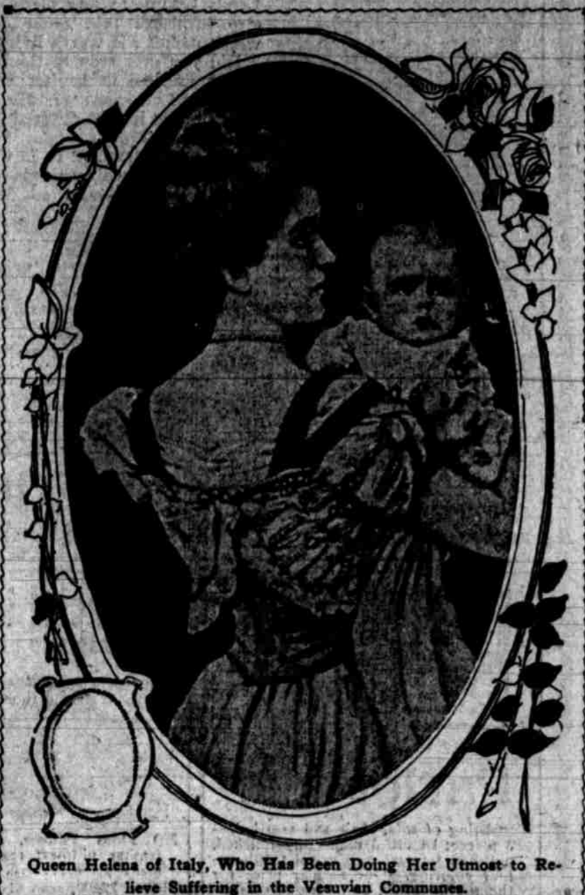
Queen Helena of Italy, Who Has Been Doing Her Utmost to Relieve Suffering in the Vesuvian Communes.

A fund for the relief of the sufferers of southern Italy, where the country has been laid waste and hundreds of lives lost by the eruption of Mount Vesuvius, will be started tomorrow in this city.