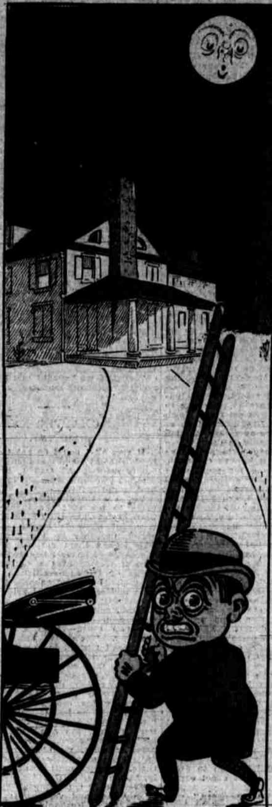
1. LEANDER: "Ye gods! I've had enough of these hard luck postponements of our marriage. I'm going to take the bull by the horns! No more delay! I'm going to insist that Lulu elope."

Copyrighted, 1906, by the American-Journal-Examiner. Great Britain Rights Reserved.