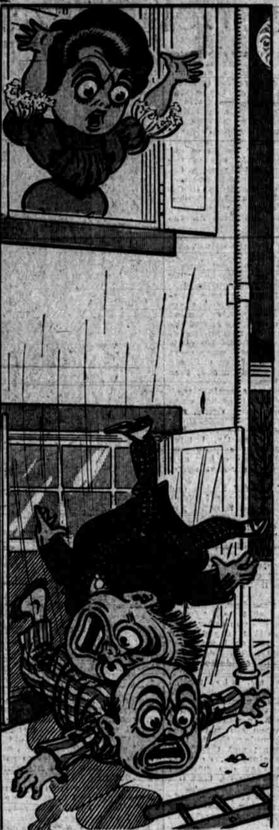
4. LULU: "Oh, Leander, LOOK OUT! You are killing Popper! Oh, Leander, why, oh WHY did you do it?" LEANDER: "W-E-E-O-O-O-P!" POPPER: "HELP! MURDER! THIEVES! Ye gods! It's that lobster Leander—I know his voice."