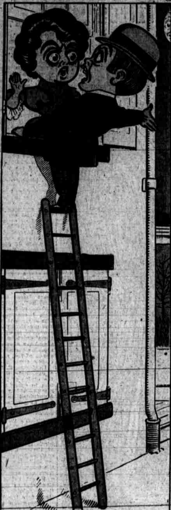
2. LULU: "Oh, Leander, what does this mean! What foolish blunder are you about to make now?" LEANDER: "Lulu, my patience is at an end. You must marry me at once. Come, get on your things and fly with me. My carriage is waiting."