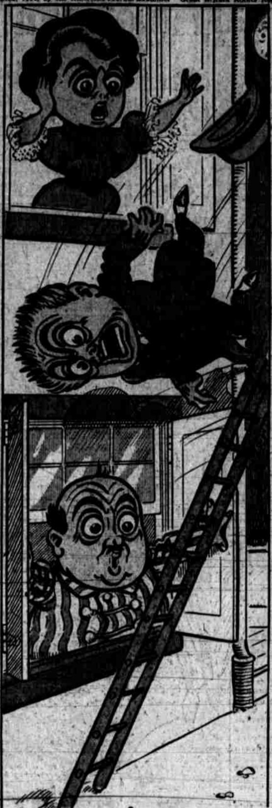
3. LULU: "Oh, Leander!" LEANDER: "W-E-E-O-W!" POPPER: "I thought I heard a noise! What's all this? Who said fly? Great Scott! BURGLARS!"