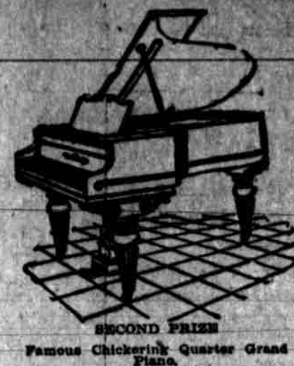
SECOND PRIZE Famous Chickering Quarter Grand Piano.